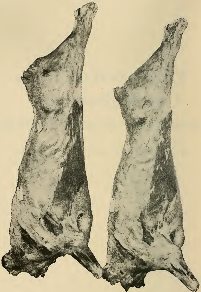
FIGURE 3.— Representative carcass produced from the good to choice lot of calves on the right and from the common lot of calves on the left. Note the fuller and smoother appearance of round, loin, rib, and chuck of the carcass on the right. (See, also, Figure 4 on page 10.)