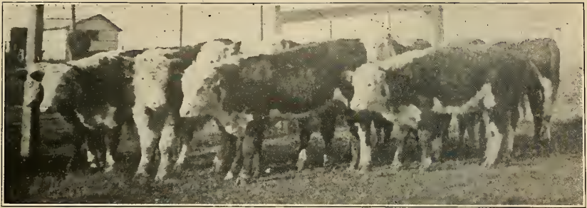
FIGURE 1. —The twelve high-grade calves which were graded as good to choice at the start of the experiment

In order to test the value of linseed oilmeal and cottonseed meal in rations for calves and yearlings the good to choice and the common calves were divided into two lots of six each. One lot of good to choice and one lot of common calves received linseed oilmeal in their rations while the other lots (one good to choice and one common) received a similar amount of cottonseed meal. Rations were composed of the same feeds and proportions for all lots except for the linseed oilmeal and cottonseed meal and were fed at the same rate per 1,000 pounds live weight. The lots of calves receiving linseed oilmeal and cottonseed meal also received these feeds in their rations as yearling steers. During the winters of 1922-23 and 1923-24 the calves and yearlings were fed twice daily. All lots were kept in pens in the barn at night and turned out in small lots during the day. Salt was kept in small boxes in all pens continuously, and all calves had equal access to water in the lots during the day. All feeds were fed in racks and troughs in the barn.