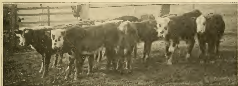
FIGURE 2.—The twelve calves of nondescript breeding, ten of which were graded as common and two as medium at the start of the experiment