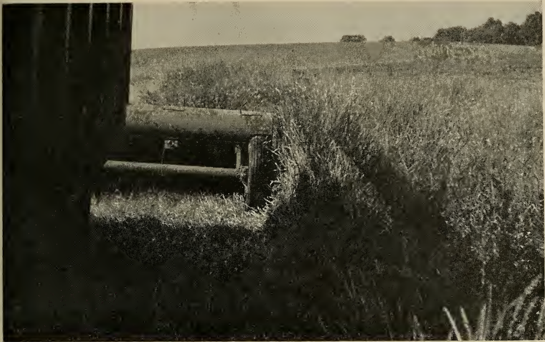
FIGURE 2. Cutting grass with the vertical rotating flail harvester after making a run over the uncut swath with the tractor to simulate a machine which was not offset. The difference in the length of stubble where the tractor wheels had been was negligible.

Both machines worked proficiently in forage less than one foot high. The horizontal rotating flails were not satisfactory in taller forage (Figure 3). The machine housing would drag the forage over excessively, and on the side where the flails were not moving into the forage, the cut was ragged. This low housing is necessary to direct the material to the discharge spout. The vertical flails would cut clean in any forage so long as the forward speed was not too great. Bulk, rather than height of the material, was the limiting factor on the rate of forward travel. Power requirements would become too high and the stubble too long and ragged when the machine was overloaded with faster forward speeds.