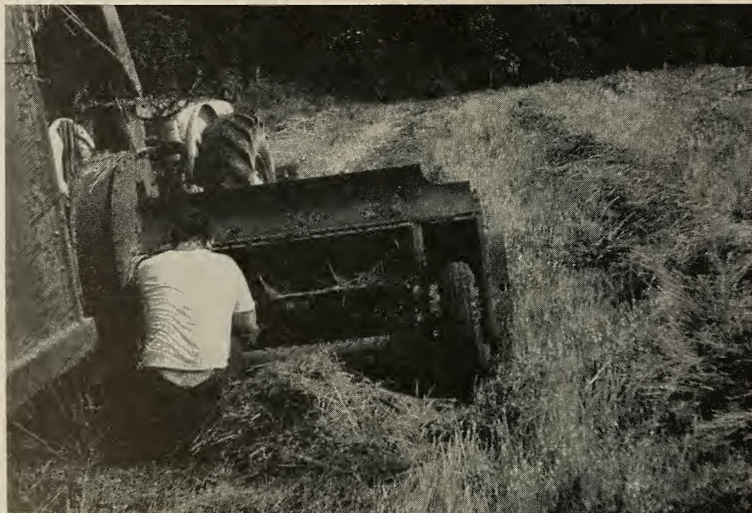
FIGURE 10. Removing forage from the blower of the vertical rotating flail harvester after attempting to pick up a windrow. The slowest possible forward speed was used (1.8 mph) with additional slipping of the tractor clutch. Estimates of the forage moisture content were 40 to 50 per cent wet basis.