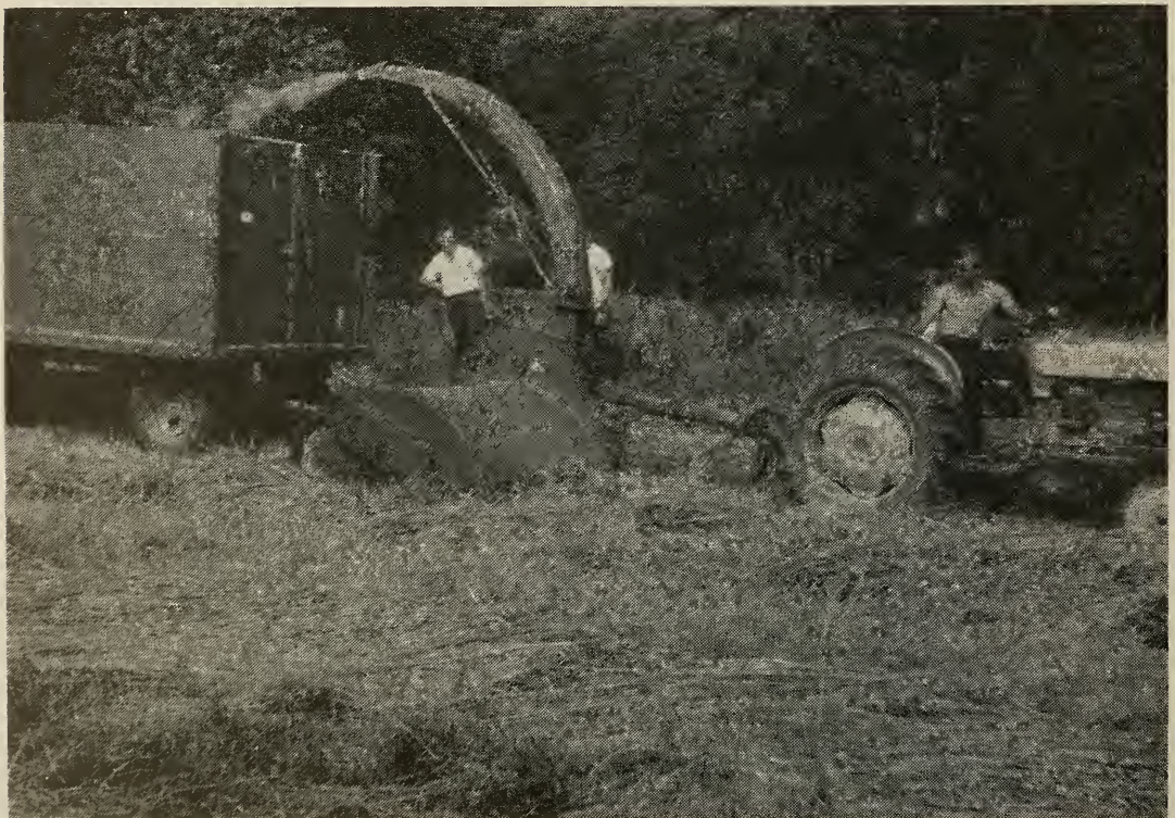
FIGURE 8. Attempting to pick up a windrow with the vertical rotating flail harvester. Estimates of the forage moisture content were 40 to 50 per cent wet basis.