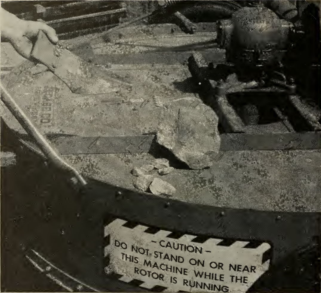
FIGURE 1. This 10-pound sandstone, accidentally picked up by a chopper with horizontally rotating flails, removed one of the four knives. Damage to the other three also occurred. The height of cut was approximately four inches.

A test was made to determine the desirability of offset and trailing positions. To do this, the tractor was run through standing forage without the machine. Then the offset machine was pulled over the area in which the forage had been depressed by the tractor wheels. This was then compared with an area in which the tractor had not pressed the forage down. The difference in stubble height in each area was very slight (Figure 2). This indicated that there is very little, if any, difference between the effectiveness of the machine which would trail behind the tractor or the one that trailed to the side.