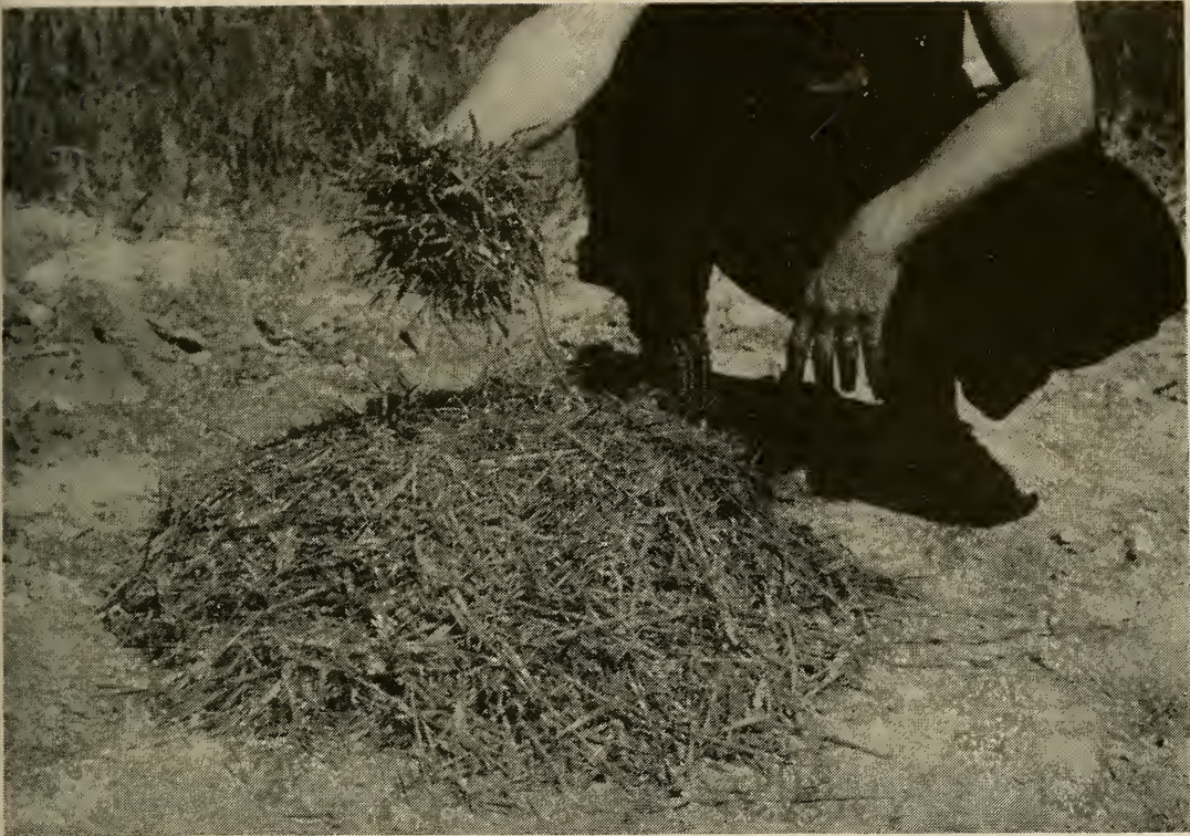
FIGURE 4. Grass cut with horizontal rotating flails. No difference could be observed in the forage chopped by the horizontal rotating flails and that chopped by the vertical rotating flails.

For second-cut grass and alfalfa mixture, 10 to 16 inches in height, and at a forward speed of three miles per hour, the horizontal rotating flails required 16 to 17 horsepower, and the vertical rotating flails 10 to 11 horsepower. The crop density would give a yield of dry hay of approximately 1.2 tons per acre. A forward speed of three miles per hour was the maximum for either machine to do satisfactory work; two and one-half miles per hour produced better results. Power tests were run at 1.8 miles per hour and three miles per hour in soybeans that were 30 inches high and would yield two tons of dry forage per acre (Figure 5). The horizontal rotating flails required 22 to 23 horsepower, but removal of the beans from the ground was far from satisfactory. The vertical rotating flails required 13 to 18 horsepower for the slower speed and 14 to 24 horsepower for the faster speed. Performance of this machine was satisfactory at the lower speeds. A two-plow tractor was necessary for the operation of either machine. A three-plow tractor was desirable when the harvester was used with a loaded wagon on rolling ground.