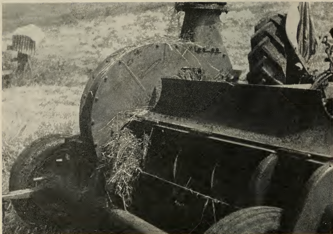
FIGURE 9. Plugged vertical rotating flail harvester after attempting to pick up a windrow. Forage moisture content was estimated at 40 to 50 per cent wet basis. The manufacturer did not intend for the machine to do this job.