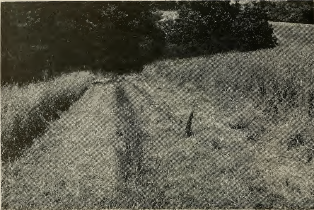
FIGURE 3. The swath at left was cut with the vertical rotating flail harvester and the two swaths on the right were cut with the horizontal rotating flail harvester. Overlapping the swath as was done with the horizontal rotating flails improved removal of the forage considerably. Removal by the horizontal flails was still considered unsatisfactory in this dense stand of lodged forage.

the cut swath. Width of the vertical rotating flails was 50 inches—the advertised cutting width. Here, the housing had a tendency to pull the forage toward the flails. This resulted in a four-inch gain in the swath width.