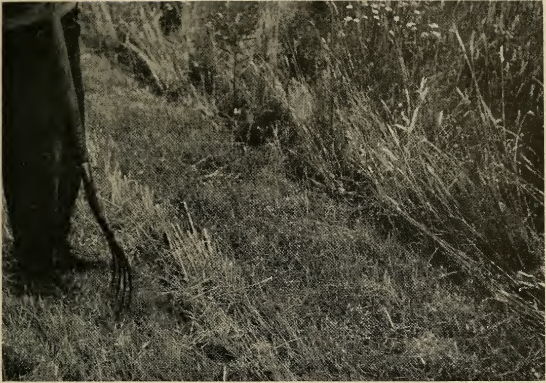
FIGURE 6. Comparison of stubble where swaths were cut with the vertical rotating flail harvester and a cutter-bar mower in dense lodged grass. The swath next to the standing crop was cut with the flail-type harvester and the one where the man is standing was cut with the cutter-bar mower.

Losses of the forage cut by the flail chopper due to raking were negligible. A side-stroke rake was used and it was observed that it left no more of the long-chopped forage on the ground than was left on the ground in raking forage that had been cut by the cutter-bar mower. Short pieces would stay in the windrow quite well. The baler would pick up these windrows with good efficiency; however, it was noted that the baler left slightly more long-chopped hay on the ground than it did when picking up hay that had been cut by a cutter-bar mower. When the hay was dry enough for baling (below 40 per cent moisture wet basis), the shorter pieces of the long-chopped material had a tendency to separate from the windrow. Even though these losses were obvious, the quantity of hay lost was negligible.