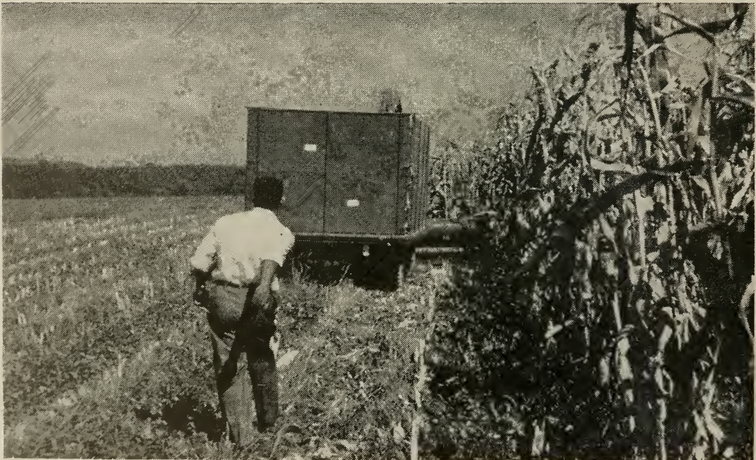
FIGURE 13. Vertical rotating flail harvester operating in corn.

No apparent difficulty was encountered with self-feeding in a box silo. Here the silage was not moved except by the cattle. Blowers moved the long-cut material at a slightly reduced rate from conveniently-chopped silage, but with no other difficulties. They could be used either for tower or bunker silos. A farmer could use the flail harvesters for silage on a limited scale if he would not object to the excessive labor in removing the silage.