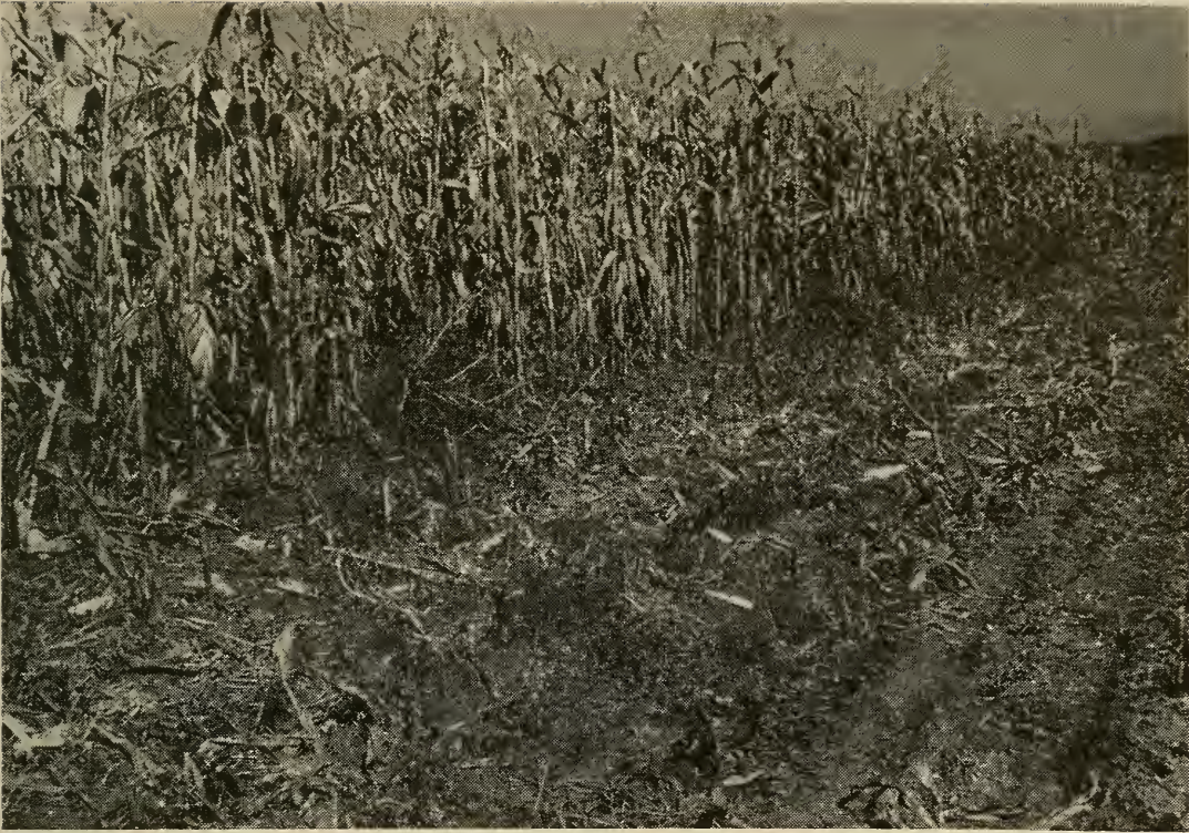
FIGURE 14. Corn forage lost by the vertical rotating flail harvester during harvest. Two rows next to the standing corn were harvested with the rotary harvester, and the other row was harvested with a conventional field forage chopper. Estimated losses of the corn cut by the rotary harvester were 3 per cent of the total crop.