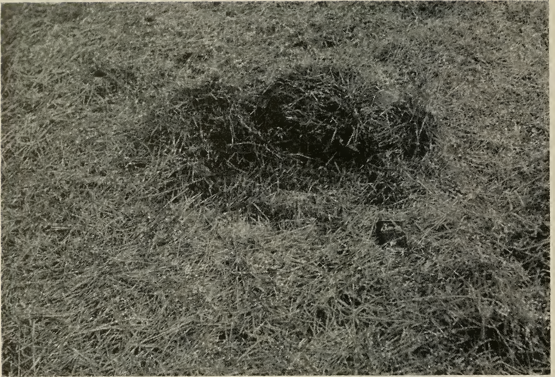
FIGURE 7. Grass cut with a vertical rotating flail harvester and partially dried for hay. The crop was exposed to rain and only the top layer would dry. The tobacco can is for scale. The forage is moved from a small area to show the depth of the swath.