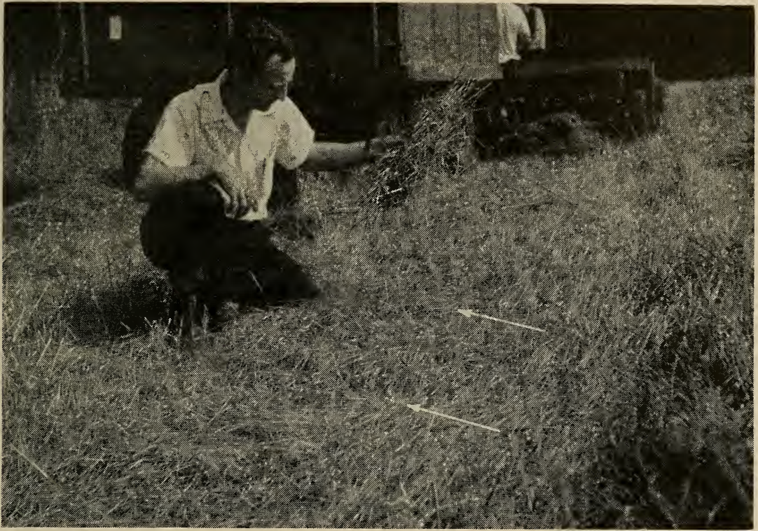
FIGURE 11. Forage remaining in a windrow after pick up with the vertical rotating flail harvester. The handful of forage was collected between the two arrows. Estimated loss was 10 per cent.