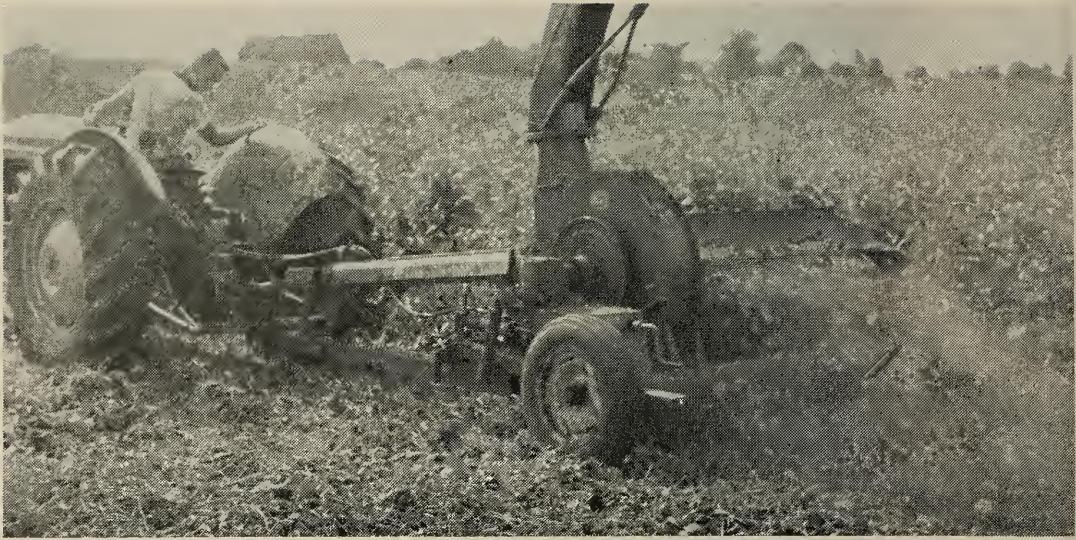
FIGURE 5. The vertical rotating flail harvester is cutting soybeans and returning them to the ground to be cured for hay. The power for this operation is being indicated by the dynamometer on the power-take-off shaft of the tractor.

to those of crushed forage. Both soybeans and a mixture of brome, orchard grass and timothy were cut with the vertical rotating flail chopper and returned to the ground for curing. The orchard grass and timothy was heavy and lodged. Better cutting was accomplished with the vertical rotating flails in heavy lodged material than with a cutter-bar mower (Figure 6). Stems were fractured in both crops. This indicated that the drying rate would be greater than the drying rate of forage cut with a cutter-bar mower.