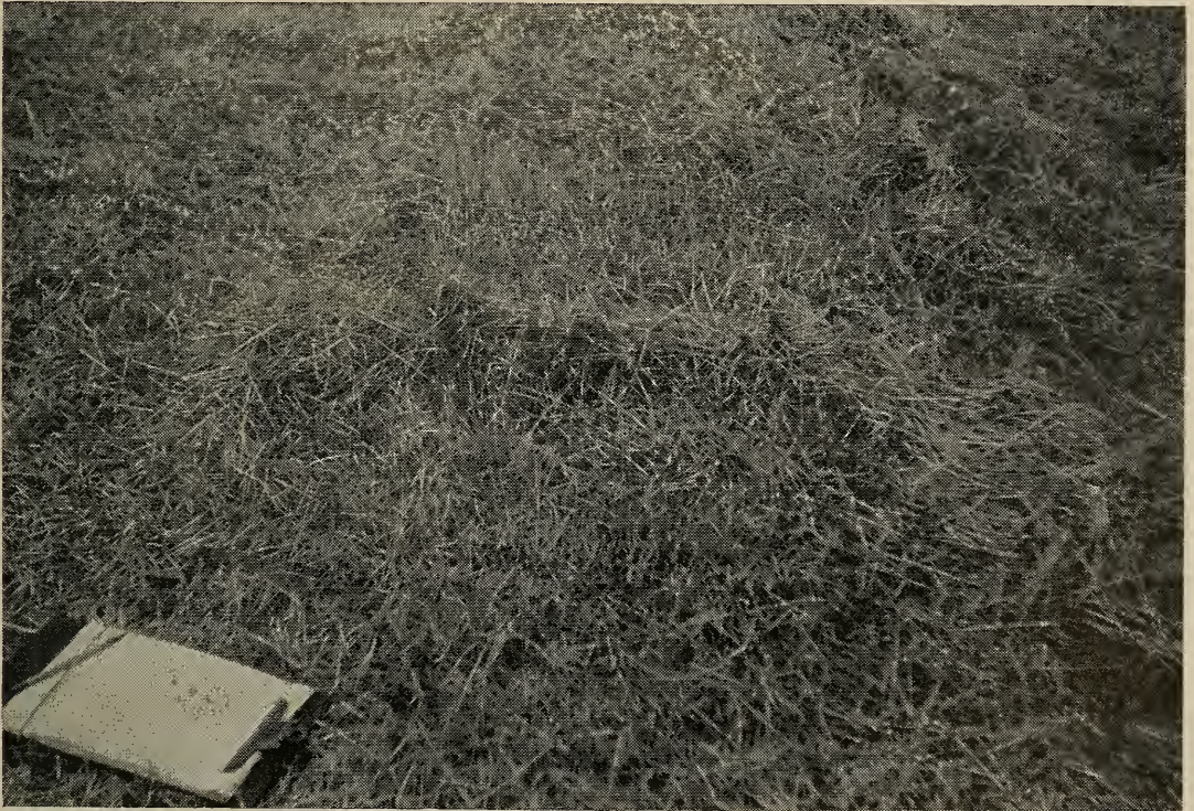
FIGURE 12. Forage remaining in the swath after pick up with the vertical rotating flail harvester. Unrecovered cut forage has been raked forward from the clip-board to better show the amount missed, which was estimated to be 10 per cent.