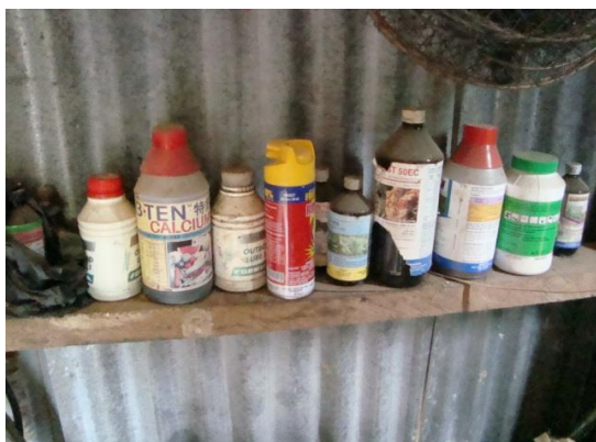
Figure 2: Pesticides and fertilizers used by the farmers in two villages

Most of the farmers that involved in this study had utilized traditional and semi traditional agricultural method in paddy cultivation whereby they are using modern method such as using pesticides, fertilizers and others as shown in Figure 2 and Figure 3. They also believe in social taboos and local knowledge in paddy cultivation.