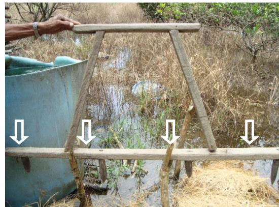
Figure 3: Seedling tools used during the planting process

The paddy yields were used for household consumption and some farmers sell the surplus to buy basic needs. Based on the observation and interview with the respondents, the acreage of land for paddy cultivation and the number of farmers has decreased as discussed in the next section in this paper. No official data found regarding on this issues.