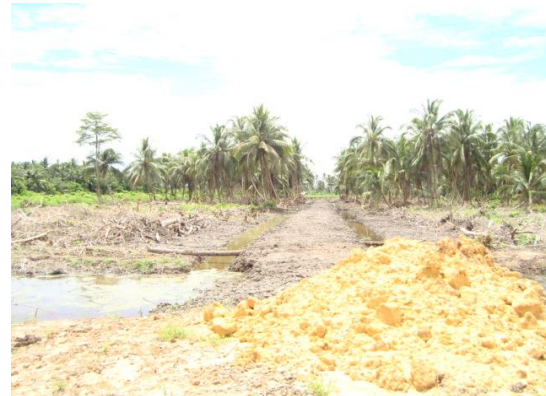
Figure 4: Land has been cleared for a small scale palm oil project

land size also makes complicate the use of better production techniques but many of the techniques and equipment that can produce high production are difficult and expensive to utilize in a smallholding farms (Jomo, 1988). This phenomenon clearly shows that the diffusion process in rapid urbanization and development brings negative consequences to rural people (Jongudomkarn and Camfield, 2006).