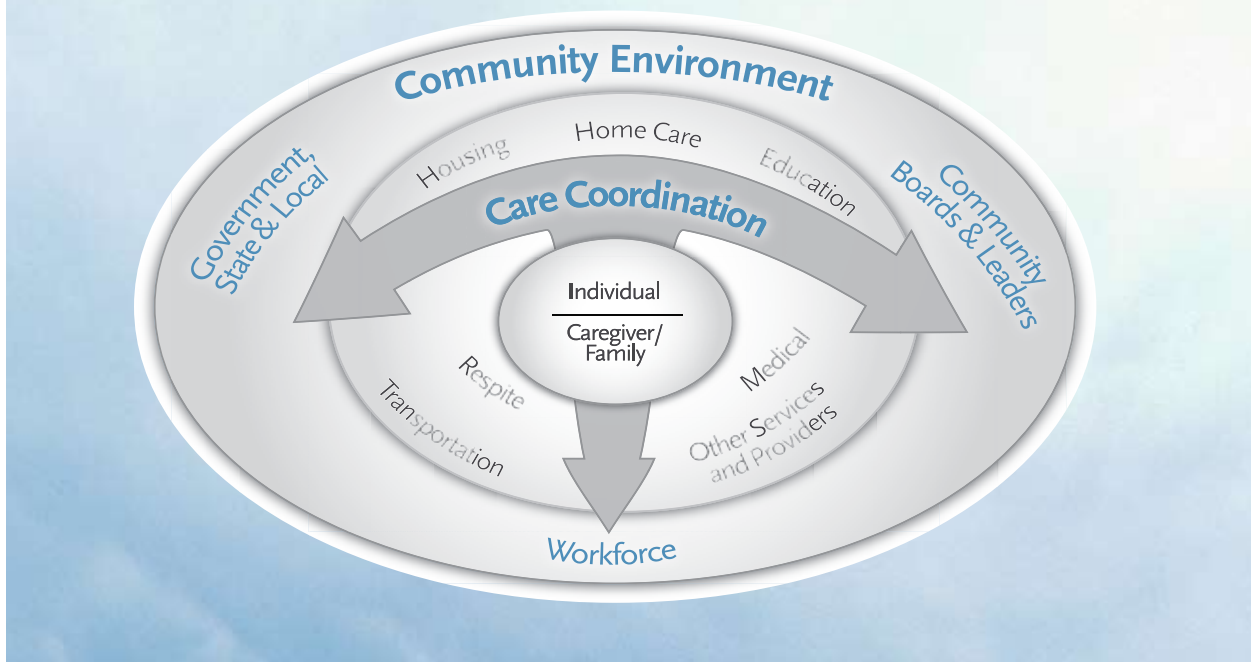
Figure 1: Rural Elder Care Options Model

These core components are shown in Figure 1 which illustrates the system envisioned by Workshop participants. The Figure shows the individual, family, and/or friends supported by a care coordination system that integrates a range of providers and services, with a community infrastructure that enables home and community based as well as person-centered, facility based care options. To deliver care, providers draw on and are supported by the community's infrastructure of services and resources including education, transportation, and community leadership organizations. The partnerships that build and sustain these components are reflected in the model by arrows indicating communication between the individual, family members, care coordinator, service provider, and other community organizations.