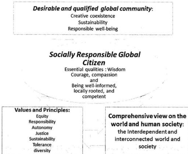
Table2 Comprehensive framework of understanding of a socially responsible global citizen (composed by the author)

The second domain is on the core values and principles in the global age majorly represented by responsibility, equity, justice, autonomy, and tolerance.