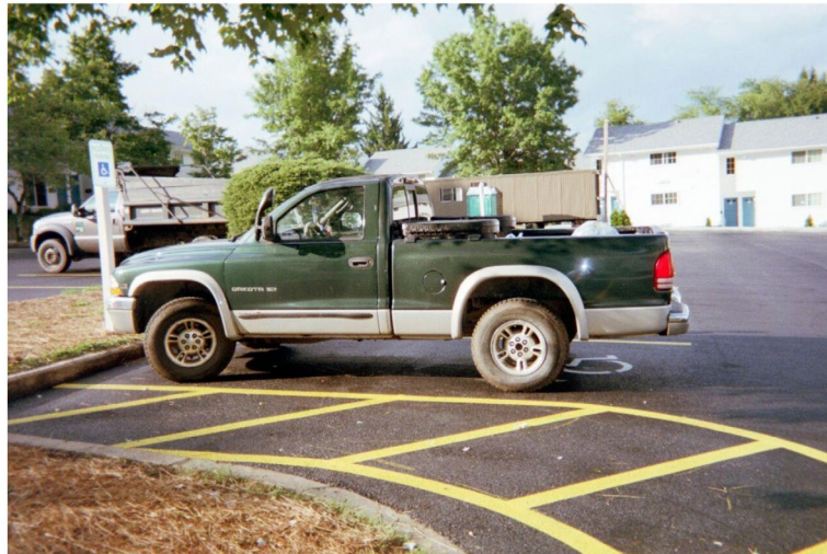
Figure 1. Truck that often needed repairs.

The impacts from food costs were experienced on a gradient from the lowest income to those with higher levels of income support. Narratives and photos from several elderly participants demonstrate agreement on the issues with affordability for those elderly participants with a low versus moderate fixed income. Every elderly participant reported issues with the affordability of food. Those with lower incomes sometimes had to choose between necessities such as medicine, car repairs, utilities, or food. Those with higher levels of social security benefits did not have to choose between everyday needs and food but rather made choices between higher priced foods versus a lower cost or substandard version.