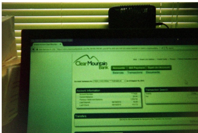
Figure 2. Participant's bank statement.

While another participant with higher benefits used a photo of her bank statement to make clear the issues with money and the tradeoffs in food quality made to manage a fixed income (Figure 2).