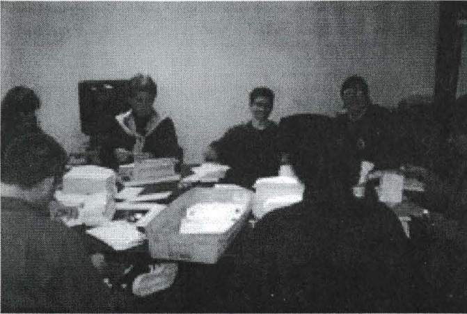
Volunteers are the heart and soul of MLGPA's activities. Here a group stuffs envelopes for a recent fundraising mailing.

Two years ago Maine was to become the first state in the nation to launch a pioneering new program that included a federal waiver to pay for early medical care for about 300 people with HIV who were ineligible for Medicaid because of their incomes.