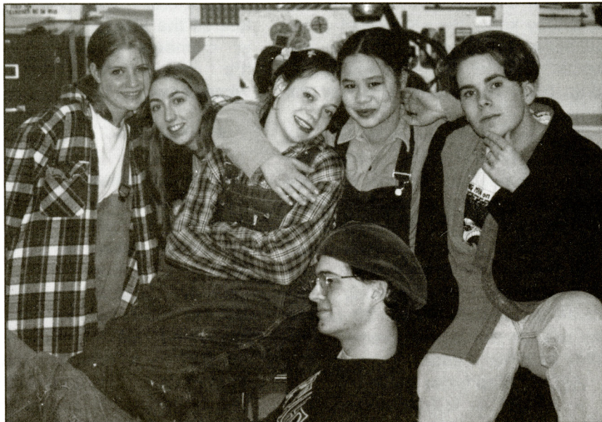
Students who attended the 3/1 School Committee Meeting

In the hallways of Deering High School one often hears the words "sex" and "condom" but on Wednesday, March 1, the talk about these topics went beyond hallway conversations and straight to the Portland School Committee. Students, parents, and other community members went to the March 1st Committee meeting to express their opinions on expanded sexual education and condom availability for the last time before the deciding vote was to be cast. The debate over these issues has been going on in the Portland community for approximately three years now. The vote was on ten curriculum recommendations to expand the sexual education program and on a service recommendation to implement a school-based health clinic. The clinic would make condoms and other services available to low-income students.