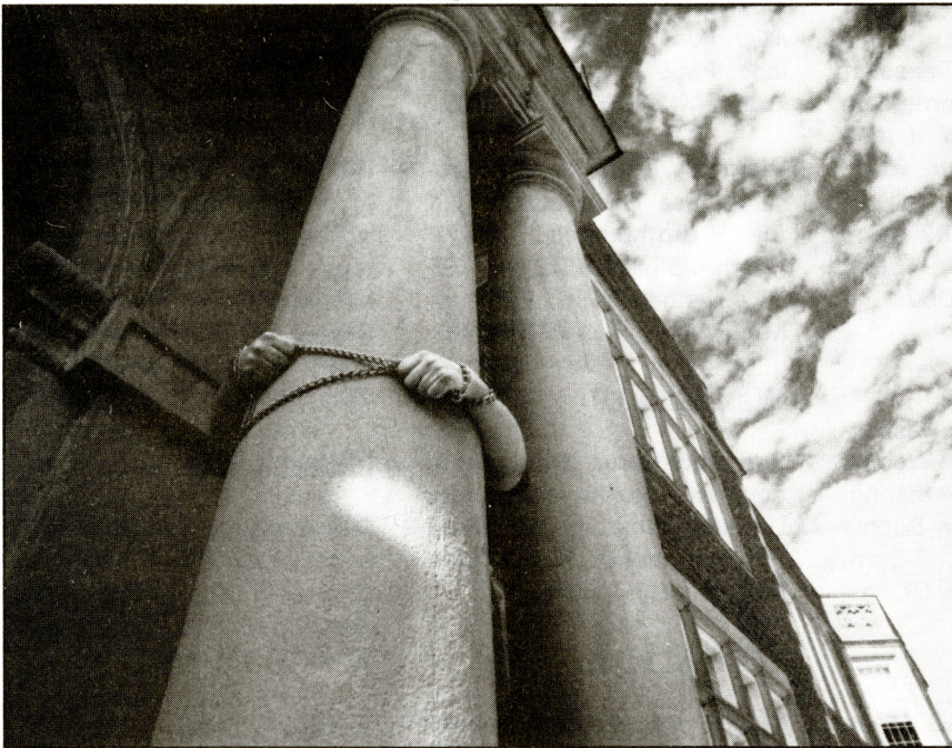
Deering students bound and determined

The recommendations were given to the School Committee by the Family Living and Human Sexuality Advisory