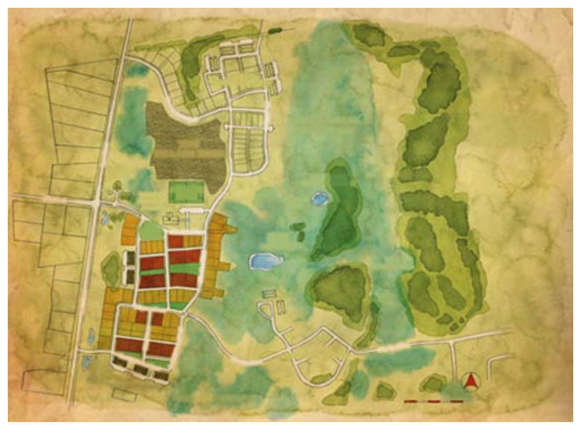
Map 3. South Village Current Promotional Site Plan showing extent of lot development (Colored lots have been developed and the two clusters of roads show the future phases of development)

Today, South Village is slowly under development with the Community Supported Agriculture operation a prominently publicized feature. Map 3 (below) shows the limited scale of current development of the site and the extensive greenways and farm areas.