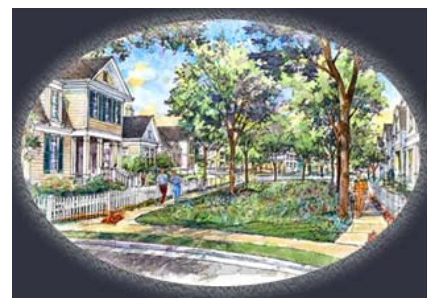
Retrovest Companies, Inc. Promotional Image of New Urbanist Concept

A case from the library of "smart growth" leadership case studies prepared by the New England Environmental Finance Center and available at http://efc.muskie.usm.maine.edu/pages/case_study_library.html