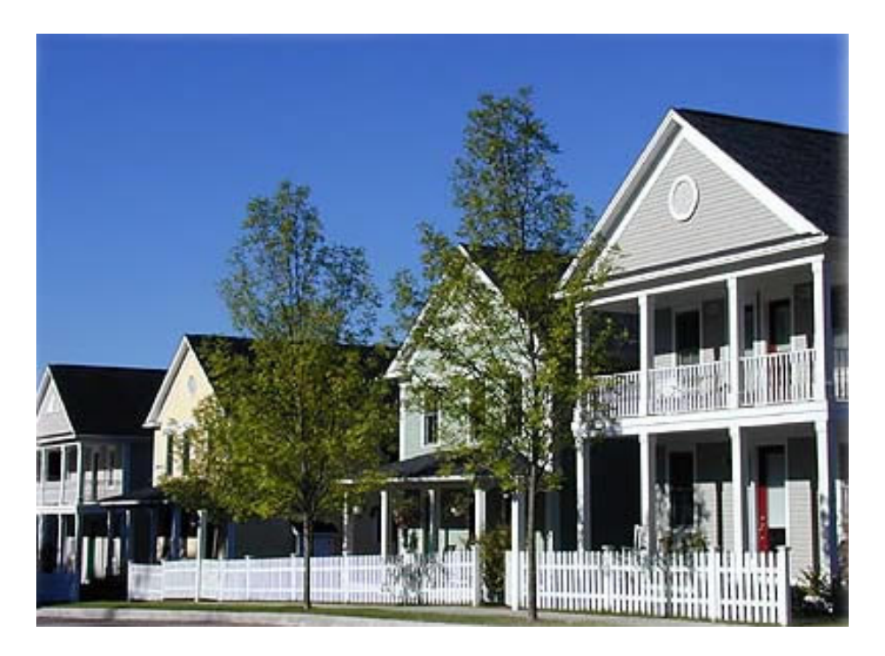
Figure 1. Streetscape of completed and occupied "Village Homes" component of the Palisades project in Stowe, VT.

By 2003, the Palisades had succeeded and raised interest around the state in close-in, higher density redevelopment projects in a traditional village center. <u>Ski Magazine</u> noted the "surging popularity of village-style living in Vermont—ironically the traditional built environment of the state's 300-year history.