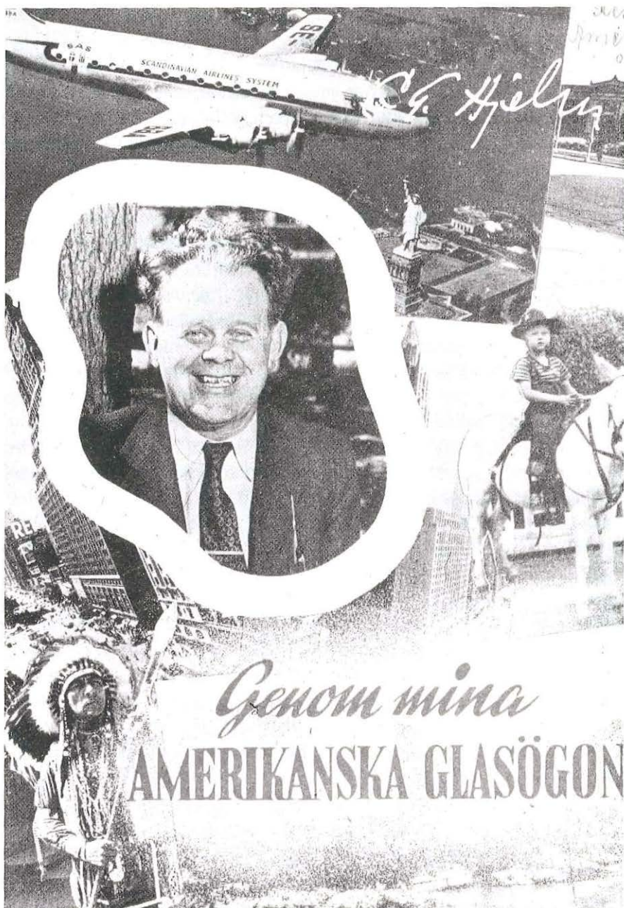
Figure 1: The cover of C.G. Hjelm's Genom mina amerikanska glasögon (1949).