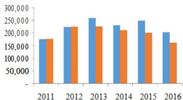
Figure 1. Plans (■) and realization (■) of oil palm FFB processing in SGH PKS

Supply chain management (SCM) is one of the approaches that can be used to understand the flow process and the transfer of goods from the raw material stage to the final consumer (Afrinando, 2012). The supply chain in understanding industry is all parties and processes and functions involved, both directly and indirectly in the fulfillment of products expected by customers (Chopra and Meindl, 2013). In order to obtain maximum performance, companies need to harmonize competitive strategies with their supply chain strategies. The supply chain of agricultural products is different from the supply chain in manufacturing products. Marimin and Maghfiroh (2013) state that there are two types of agro-industry supply chains, namely supply chains for fresh products and supply chains for processed agricultural products such as CPO. Lembito (2013) revealed that the Supply Chain Management model is a business strategy to improve the competitiveness of palm oil agroindustry in Indonesia.