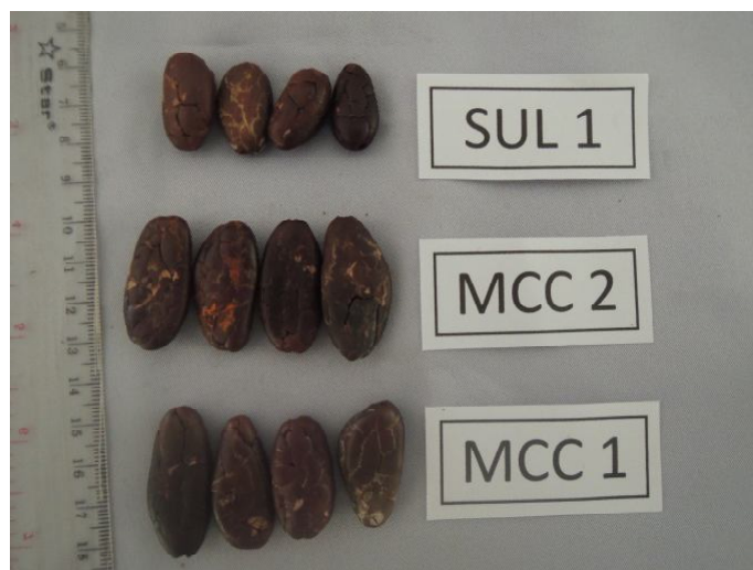
Figure 5. Nib size of MCC 01, MCC 02 and Sulawesi 01

Note b : Classified according to Indonesian National Standard (SNI), namely AA (maximum 85 beans per 100 g) or 1.17 g per dry bean, A (86–100 beans per 100 g) or 1.16–1.0 g per dry bean, B (101–110 beans per 100 g) or 0.99–0.90 g per dry bean, C (111–120 beans per 100 g) or 0.90–0.83 g per dry bean, and S (>120 beans per 100 g) or <0.83 g per dry bean.