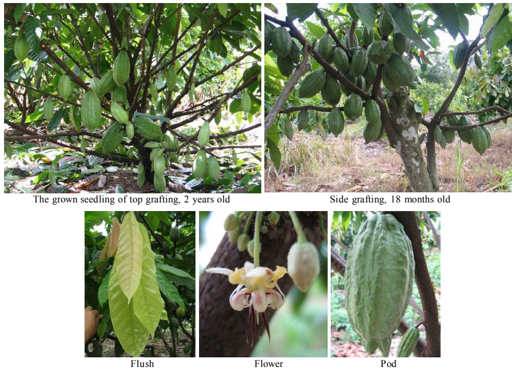
Figure 1. Performance of MCC 01 in the field indicating a high potency of yield