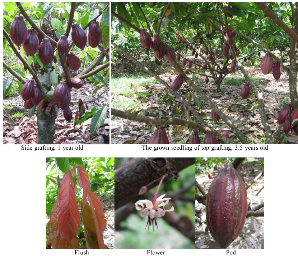
Figure 2. Performance of MCC 02 in the field indicating a high potency of yield