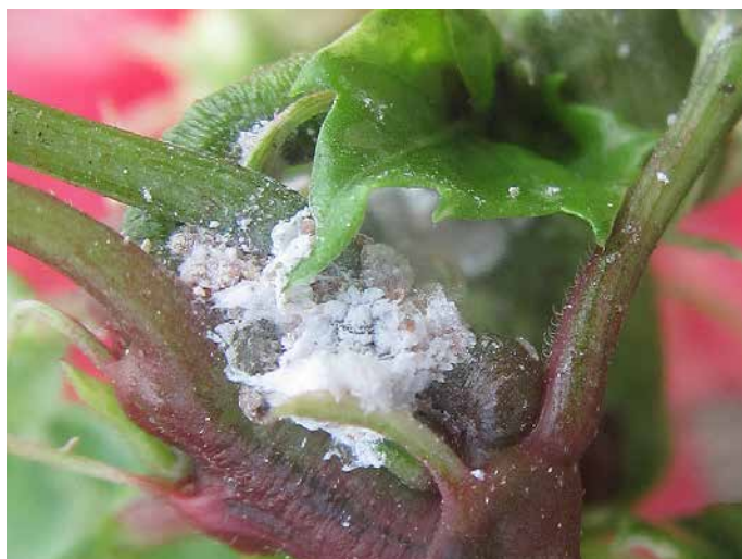
Figure 1. An aggregation of Maconellicoccus hirsutus (Green) on leaf axils of Hibiscus rosa-sinensis , San Andres Island, Colombia.

Despite the vicinity of San Andres to Central America, the PHM was likely introduced to San Andres from mainland Colombia on ornamental plants because of the constant trade between the island and mainland Colombia (Kondo et al. , 2012). High populations of the PHM can result in prolific production of honeydew, subsequently causing sooty mold growth, and heavy populations may cause host-plant wilting; the mealybug injects a toxic saliva during feeding, which can cause a characteristic symptom known as bunched top in hibiscus (Hodges and Hodges, 2006).