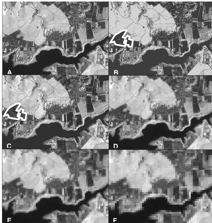
Fig 2. Input images for textural features calculation: (A). A 256 grey level, (B). Image segmentation in four classes, (C). Image segmentation in eight classes, (D). Averaging filtered with 3x3 pixels, (E). Averaging filtered with 5x5 pixels, (F). Averaging filtered with 7x7 pixels.

Figure 2 shows a portion of the study area in a 256 grey level (A), segmented into four classes (B) and eight classes (C), and averaging filtered using window sizes of 3x3, 5x5, 7x7 (D, E, F), respectively. Fallow land, which is indicated by area with white border, was classified into the same segment with water feature, in case of B. But the performance of the segment class was different when the whole image segmented into eight classes (C), where the fallow land consists of two segments, i.e, segment with grey level values of 0-39 and 40-58. The grey level value of the whole image was averaged using window sizes of 3x3, 5x5 and 7x7 pixels as shown in figure 4D, E, and F, respectively. The figures show that the performance of the spectral visualization is different each other.