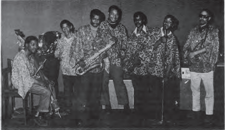
The Complete Band – from left to right: