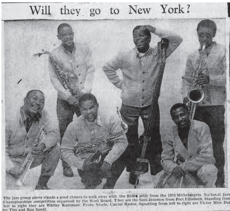
Figure 25. Soul Jazzmen newspaper clipping from 1975 reporting the news of Soul Jazzmen's likelihood to win the festival competition.