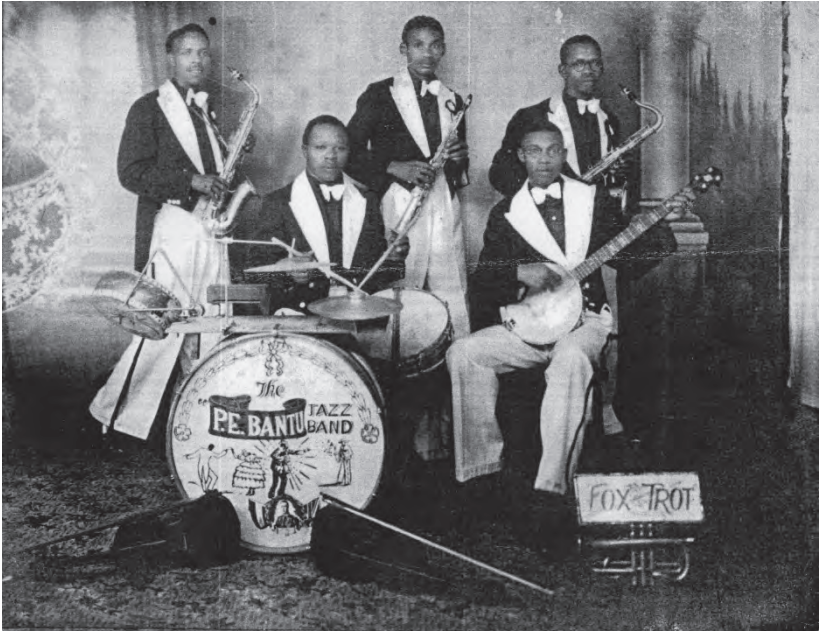
Figure 5. PE Bantu Jazz Band, the oldest photo of a “dance band” that pre-dates the swing band era discovered during this research. The photo is thought to date from the 30s–40s.

Travelling vaudeville troupes and dance concerts (commonly referred to as “concert and dance”) strengthened the impact of black music in the country. 12 Schools began to teach syncopation and the new styles. By the 1940s a unique South African musical language was being born that joined local innovations with influences of American big band swing. Radio broadcasts and the growth of the recording industry allowed these styles to gain huge popularity from the 1940s–50s onward as South African jazz became rooted in marabi and the mbaqanga that followed it. Influences of traditional South African music such as the whole step chord progression of Xhosa uhadi and Zulu umakweyana bows found in Abdullah Ibrahim’s composition “ Mannenber g” and Tete Mbambisa’s “ uMsenge ” — a favourite of Soul Jazzmen’s bassist/vocalist, Big T Ntsele — added to the uniqueness of the music.