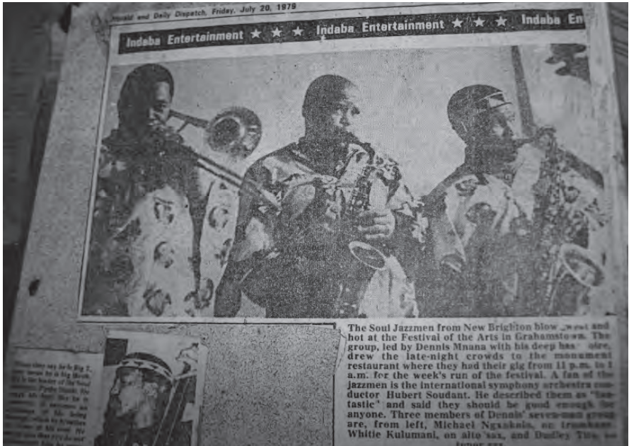
Figure 26. Clipping from the East London Daily Dispatch on the wall of D. Tito's Ave A workshop reporting on the Soul Jazzmen playing at the National Arts Festival in July 1979.