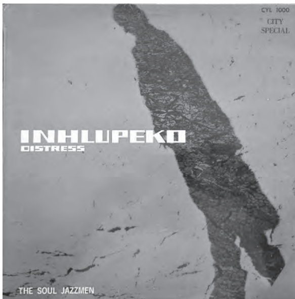
Figure 23. Front cover of the Soul Jazzmen's vinyl LP released by City Special (CYL1000) in 1969 and re-released by Matsuli Music (MM107 UK) in 2015. The title is spelled Intlupeko on the record labels.