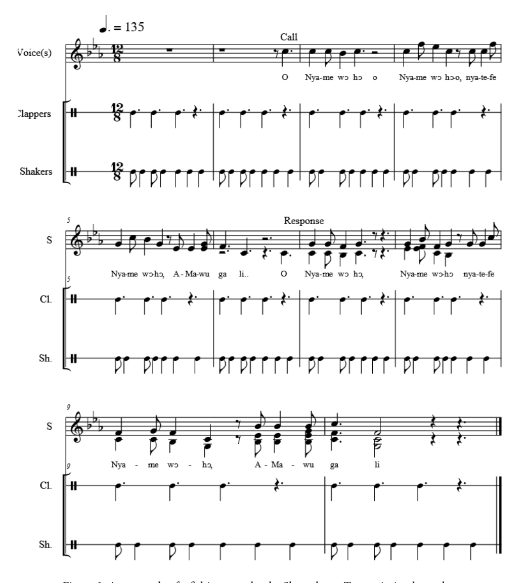
Figure 3: An example of a fishing song by the Shatta boys. Transcription by author.

The response was the same in every case. None of them knew any of the songs although they clearly recognized the style and could identify with it. A tenable reason could be the difficulty of the language as discussed earlier. The modification I present to this general claim is that, the full repertoire of Duakor fishing songs now contain 'general knowledge' songs that are known and sung by the Fante fishermen even if it is only a pastiche. The point is, that while the Duakor fishing songs may not be known to people outside the fishing community, some of their songs are known by the Fante fishermen who work with them along the shore.