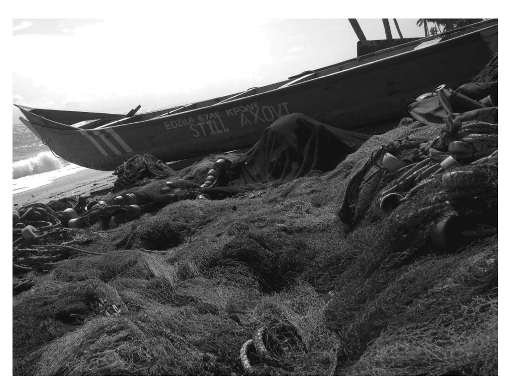
Figure 2: Example of an inscription on a canoe.

they sang two, one-hour medleys of fishing songs. Recording in the studio allowed for a 'cleaner' version of the songs devoid of the din that comes with their work at the shore. The examples of fishing songs that are referred to in this article are from these recordings.