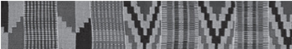
Figure 2. A strip of adwineasa kente cloth

A kente motif that resonates most with this paper’s theme of creativity and knowledge is adwineasa , which literarily means “all the motifs have been exhausted,” or “completely explored,” in the process of producing this exceptional kente cloth. In the past only the royalty exclusively and deservingly wore it. Accordingly, the motif name adwineasa exemplifies a conscious critical aesthetic evaluation of the design that occurs in the creative imagination of kente weavers and reflects various degrees of their ingenuity. Only master weavers are able to produce this artistic nexus of the several intricate motifs that comprise adwineasa , which articulates the acme of creativity, innovative perfectionism, artistic expressivity and application of rare traditional knowledge. Fittingly, another translation of adwineasa is “all knowledge or skill has been exhausted.”