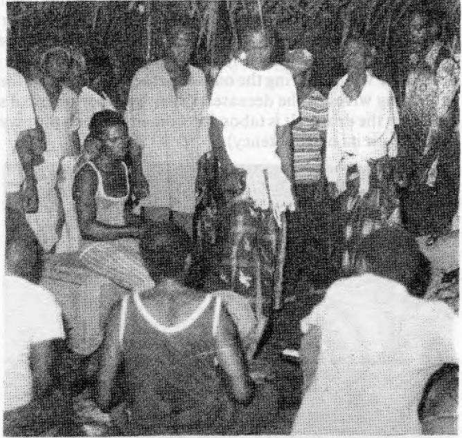
Fig. 4 A professant, the first son of the deceased, surrounded by supporters acts in front of ese drum row. The master musician has his back to the camera.

boasts about the virtues and heroic accomplishments of his deceased father. The entire audience present acts as witness. They, as well as the master musician (on the drum row), will acclaim or endorse a true and worthy achievement so declared. During the profession act ese music plays mood themes, sotto voce. There are, however, occasional musical bursts with which the master musician intersperses the profession, or prompts, encourages, queries and answers the professant. At any appropriate stage in the course of the act which is performed as an impassioned dramatic display involving two protagonists — the professant and the master musician — the professant will round off a declaration with the oath statement “If it is not as I have said, may this ike ese kill me”.