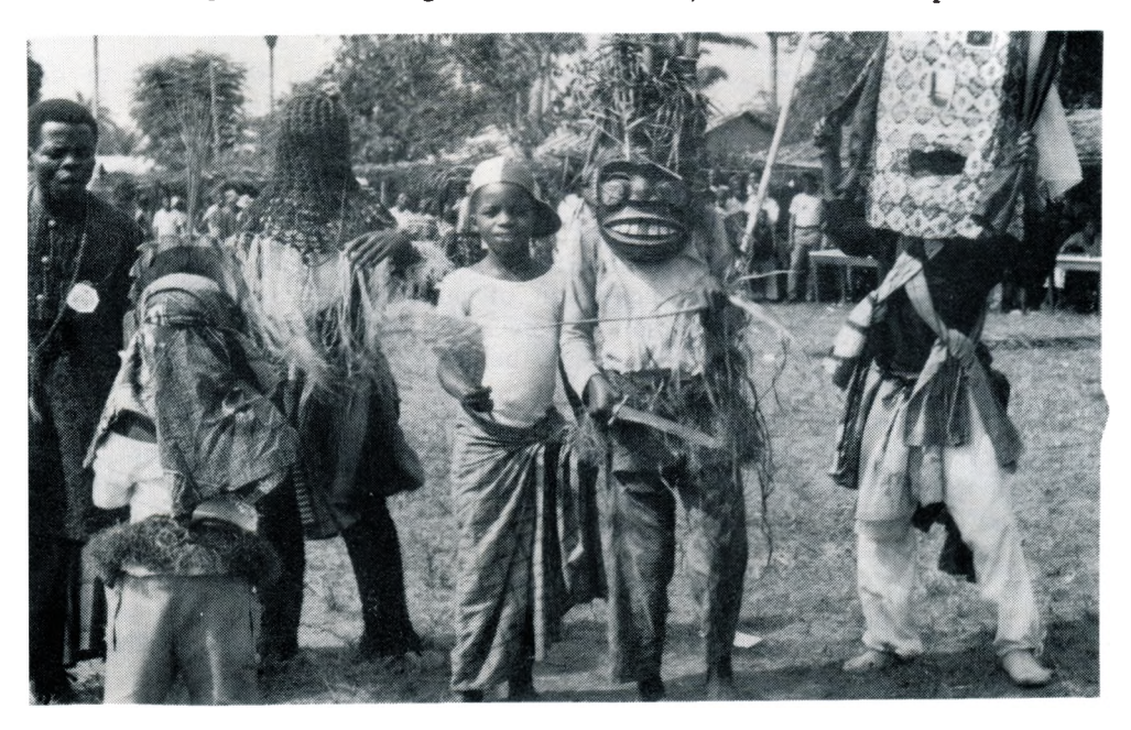
Talents are discovered early in life and could develop into maturity at tender age

In his capacity as any, some, or even all of the above (most artists specialise in more than one aspect), the talented folk musician has a ready wit (often incisive) to enliven his power and style of delivery. Wit becomes an invaluable asset especially when the artist is required to extemporise. The folk musician possesses abundant gift of melodic and rhythmic innovativeness which accentuates the expressiveness of his texts and movements. A declamatory or singing voice (vocal or instrumental) that satisfies the ethnic concept of admirable voice quality is cherished and respected. Above all a confident grasp of the language of folk music in all its dimensions, and a resourceful talent, sharp on improvisation on any theme (whether of song, text, dance, dramatic hint or instrumental melorhythms) distinguish the masters from the generality. Though there may be no recognised subsistence professionals per se in most Nigerian ethnic cultures, there are amateur professionals