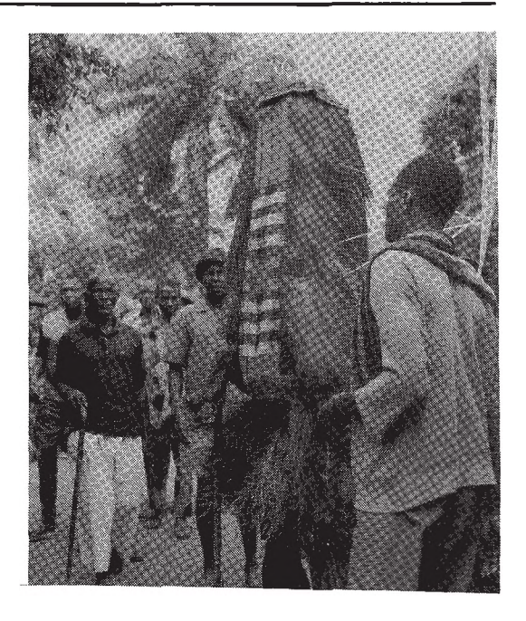
Festival atmosphere: the esoteric spirits materialise to commune with the humans

1. In Abua, Rivers State, the timing of Onwuema , the all embracing and most important spiritual masquerade festival, coincides