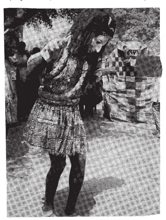
Water spirits and monstrous animal shapes continue to inform folk music practices

1. Anko music in Calabar, though highly esoteric (it belongs to Anko cult) is a purification