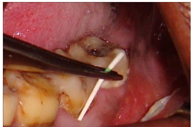
Figure 1. Plaque sample collected with paper point

Culture methods for recovery of bacteria are still the gold standard in microbiology. After subgingival plaque samples were collected, they were immediately transferred to a thyoglycolate agar medium (Figure 1). Prevotella intermedia was identified in a pure culture grown in a blood agar anaerobic medium. Gram staining was employed for preliminary identification of Prevotella intermedia and its pleomorphic morphology. As Prevotella intermedia is an aggressive periodontal pathogen, specific pathogenic characteristics were identified including its proteolytic and fibrinolytic activity and the presence of a capsule. Its catalase negative characteristic was also identified.