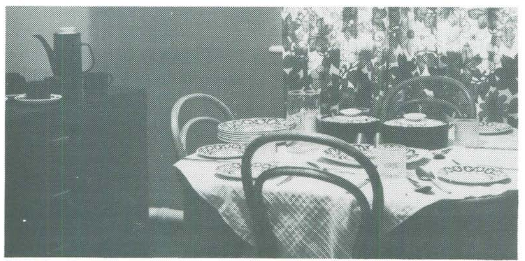
DINING ROOM: - Items Made (a) Curtains (b) Wall Decor (c) Furniture Renovated.

To sum up, the flat provided an outlet for large ambitious work requiring co-operate