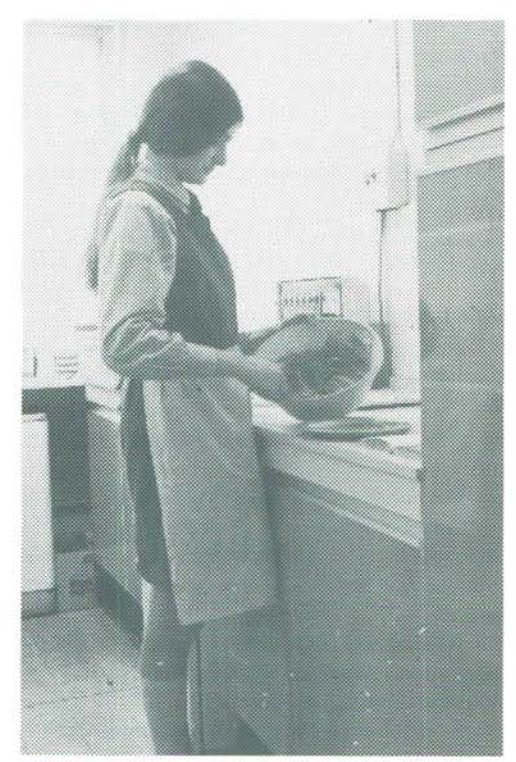
Fitted Kitchen with Manufactured Units.

For the ceiling and walls emulsion paint was chosen in honeydew with a white door and window.