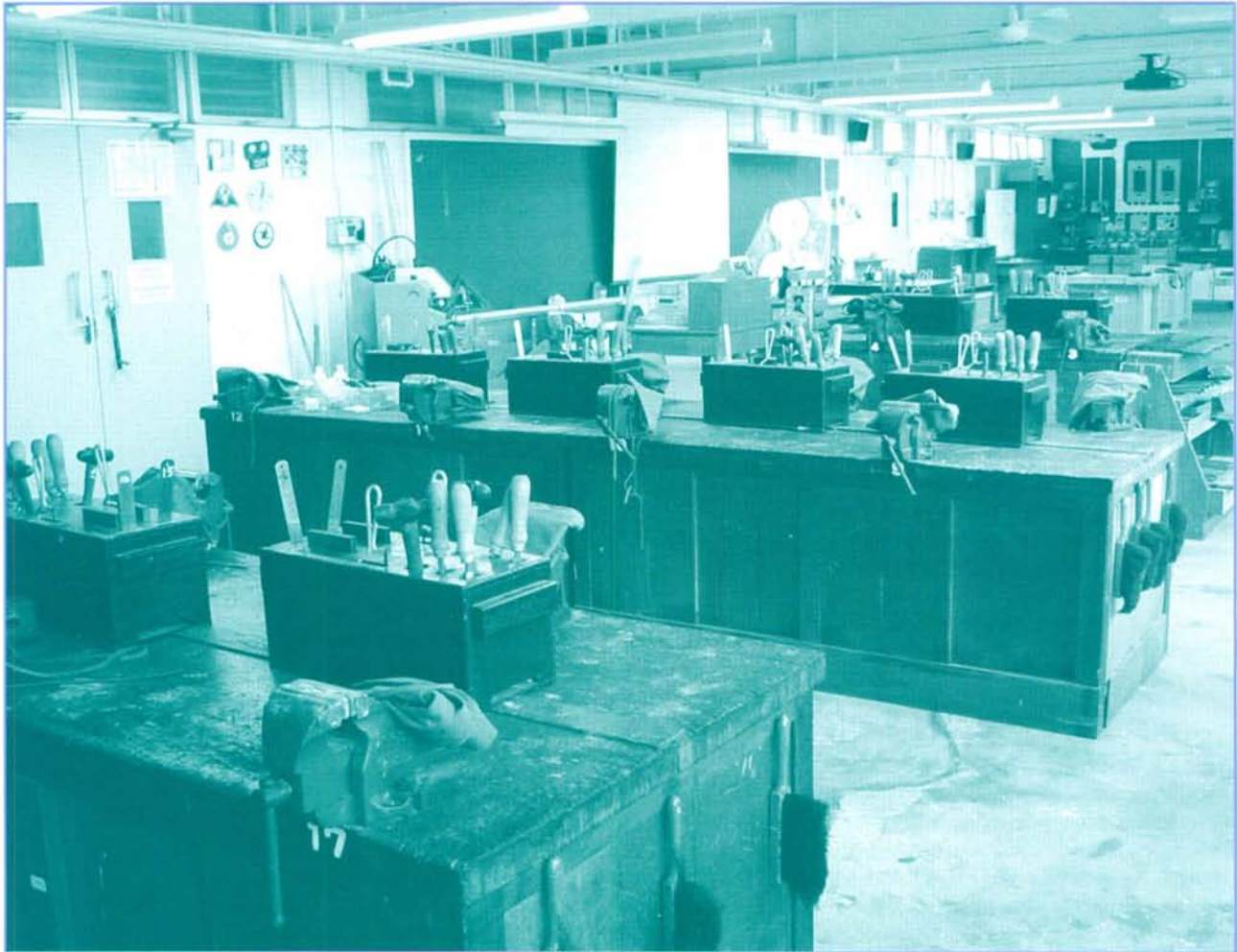
Figure 2: Traditional metalwork workshop in secondary school.

education development of Hong Kong (more correctly: craft, apprentice, and technical training). At that moment, the school (the only one existing at that time) offered apprentice courses (three or six years) in mechanics, cabinet-making, tailoring, and shoe-making to students after their elementary studies. Besides providing industrial training, the school was also designated as a reform institution by the government. In 1952, the Aberdeen Industrial School was renamed as the Aberdeen Trade School. This change marked a milestone in skill training, that the industrial school would no longer strive for practical correctional training. The subjects offered at the trade school included handwork, with the following subject elements: bookbinding, carpentry, metalwork, pottery, leatherwork, paperwork and carving (Aberdeen Technical School, 1985). In 1957, the school also took the first step towards becoming a technical school, that is, Aberdeen Technical School (a secondary level school).