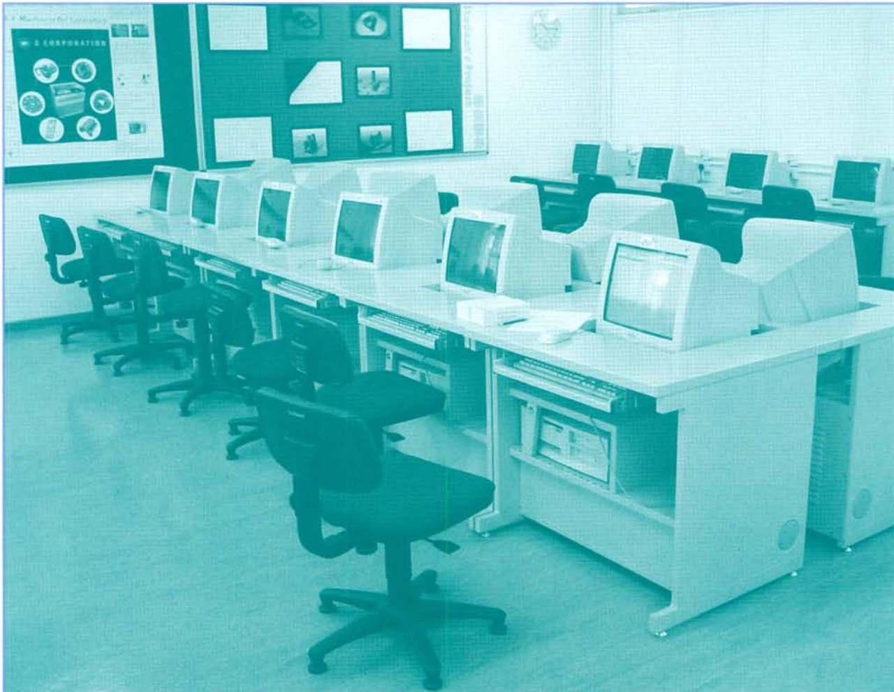
Figure 4: Computer aided design workshop in secondary school.

resulted in the training of skilled labourers becoming one of the core aims of many schools, in particular those offering education to the lower-class sections of the population. Further, in countries or cities such as Hong Kong, which lack natural resources, training manpower to service the mass production industry seemed essential in education, and sometimes the only reason for its existence.