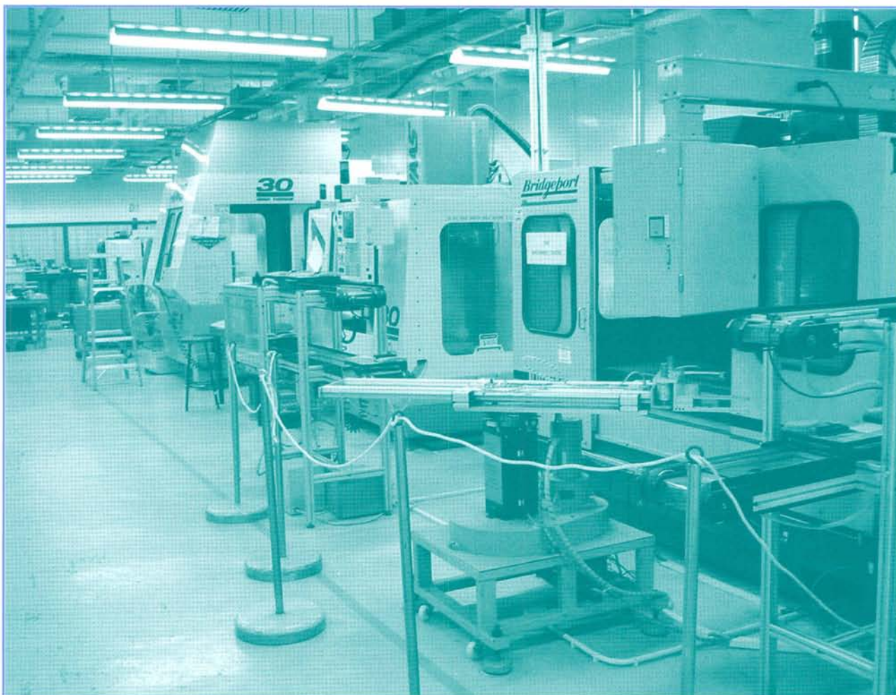
Figure 6: Remote site for production of students' projects (Industrial Centre, The Hong Kong Polytechnic University).

offered until now, though the syllabus has been revised several times.