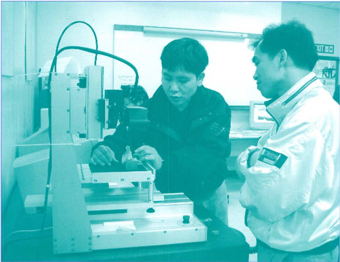
Figure 10: Industrial training for technology teachers at the Industrial Centre of The Hong Kong Polytechnic University.

also endless tracing game if schools want to keep in line with the high-tech and updated standards of facilities used in industry.