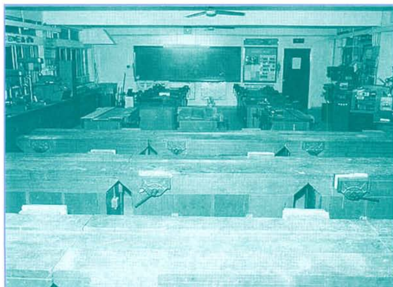
Figure 1: Traditional woodwork workshop in secondary school.

Apart from the traditional Chinese-style apprentice training, formal technology education in Hong Kong can be traced back to the craft subjects offered in the 1930s. The first industrial school, the Aberdeen Industrial School, established in 1935, is a good example illustrating the early technology