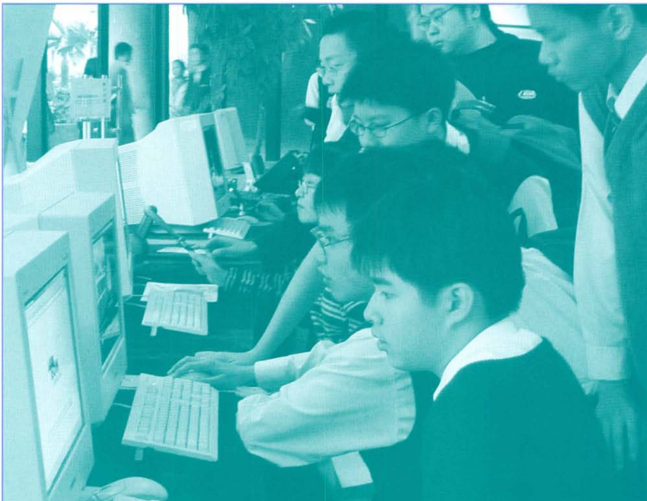
Figure 8: Student visits at the Industrial Centre of The Hong Kong Polytechnic University.

technology. Using computers as a media and web-teaching tool for delivering materials has become more common in the subject. Computer-aided tools have made changes in the curriculum so that students have no need to spend so much time learning traditional technical skills, for example, conventional technical drawing. Unlike the traditional implementation of final products (that is, physical objects), students also submit their work by using different means, such as 2-D and 3-D computer graphics and models. The role of teachers has also changed in that they are not the only source of knowledge for students. Students are encouraged to explore/find out answers by themselves by using new technology and inventions (for example, computers and the Internet).