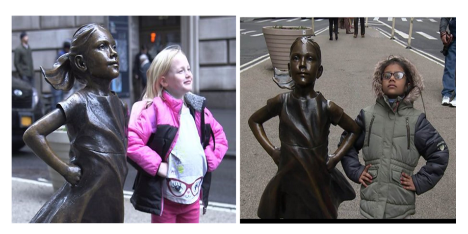
Figure 3 Tourist Photos: Fearless Girls

DiModica, however, did not share the warm sentiment and was vocal about his displeasure. At a press conference, he derided the installation of Fearless Girl as an "advertising trick."<sup>13</sup> His attorneys fired off a letter to New York Mayor Bill De Blasio demanding that the interloping sculpture be removed.<sup>14</sup> They accused State Street of violating DiModica's copyright by making a "deliberate choice . . . to exploit and to appropriate the Charging Bull through the placement of Fearless Girl."<sup>15</sup> Mayor De Blasio weighed in on Twitter and charged DiModica with perpetuating the sexist exclusivity the sculpture was meant to challenge: "Men who don't like women taking up space are exactly why we need the Fearless Girl."<sup>16</sup>