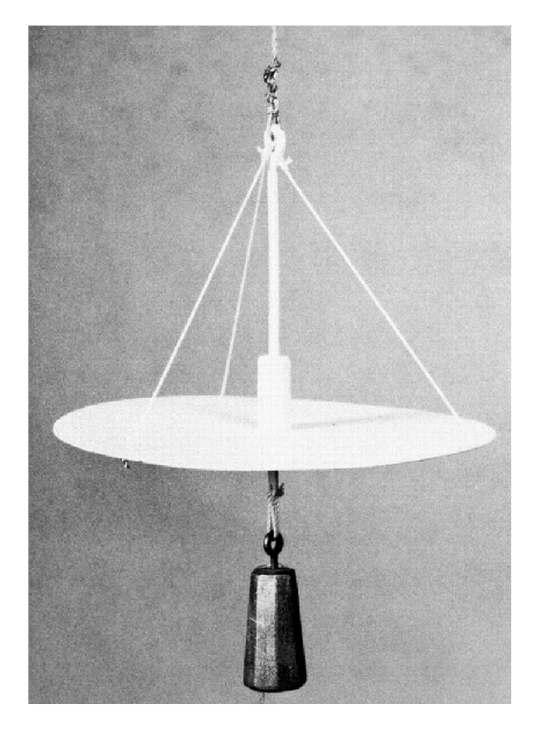
FIG. 2 Luksch polished white painted Secchi disc of 45 cm in diameter used onboard the " Pola " around 1890.

FIG. 1 Brewster's hydraulic tube telescope for viewing objects underwater (1813); "When the apparatus is plunged into the sea, the floating parallelepiped MN will keep the tube ABCD in a vertical plane, and by moving it around the pivot P, it may be directed to any object under water or at the bottom" (Reproduced by the author from the original work).