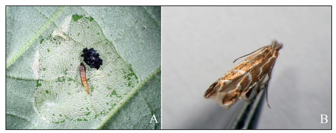
Figure 3. A – Opened Ph. issikii mine with a pupa and a heap of excrement; B – Ph. issikii adult of the aestival marked form (Photo by J. Dobrosavljević).