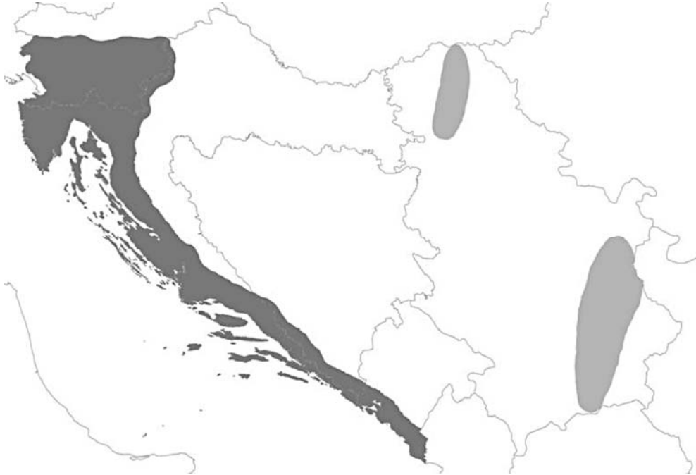
Figure 5. Map showing current distribution Prenolepis nitens (Mayr) in the western part of Balkan Peninsula based on available literature data.

The continuity of finds along the wider area of the Adriatic coast is perfectly understandable, but Serbian finds are very interesting and indicate the need for very subtle analysis of this species' local populations and metapopulations in the inner parts of the Balkan Peninsula.