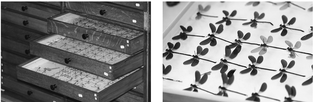
Figure 1. Dragonflies in the entomological collection of Viktor APFELBECK in National Museum of B&H.

In the collection of Viktor APFELBECK 1.079 specimens of dragonflies are stored (Fig. 1). During a survey of the material in this collection 87 specimens of dragonflies from Bulgaria were found.