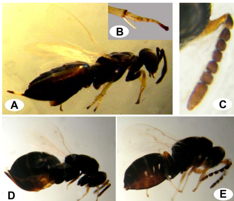
Figure 1. Eupelmus microzonus : A – Female in lateral view, B – Midtarsus; Eurytoma laserpitii : C – Antenna of female, D – Female in lateral view, E – Male in lateral view.

Biology: We reared this species for the first time on O. ochropus feeding on Lathyrus sativus , but it is distributed in Central and Eastern Europe and Transcaucasia as a parasitoid of gall midge (Diptera: Cecidomyiidae) larvae (Zerova & Seryogina, 2006).