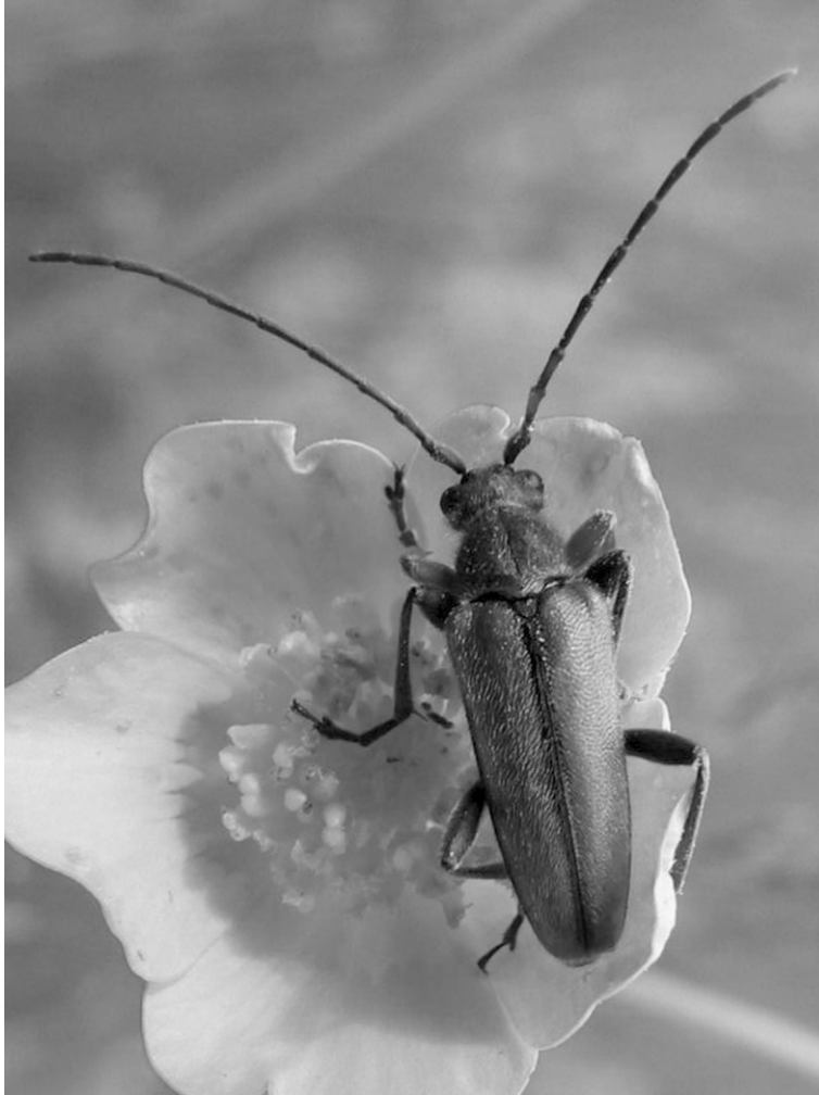
Figure 3. Cortodera flavimana (Waltl, 1838) (photo Milan Đurić, 2009).

Notes: First record from the Đerdap National Park. Reported from a small number of localities in Serbia (ILIĆ, 2005). Present on cutkins or leaves of oak during sunny days in May in the Đerdap National Park.