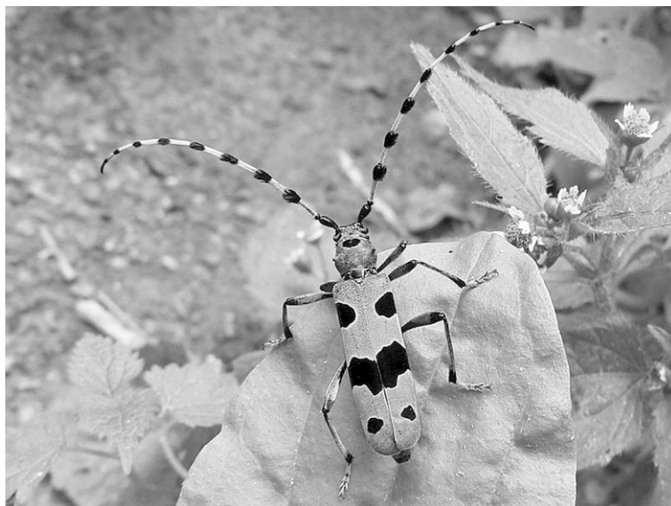
Figure 5. Rosalia alpina (Linnaeus, 1758) (photo Milan Đurić, 2009).