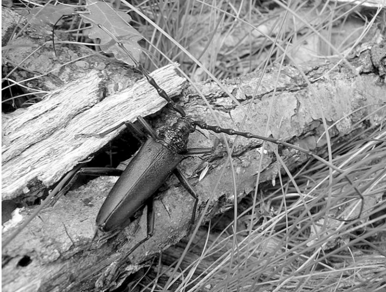
Figure 4. Cerambyx (Cerambyx) cerdo (Linnaeus, 1758).