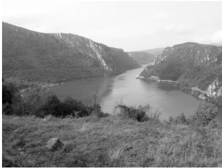
Figure 1. A view of the Đerdap National Park (photo Milan Đurić, 2012).

the investigated localities ranges from 49 to 803 m a.s.l. Deciduous forests with beech, Turkey oak, hornbeam, linden, hawthorn, hazel and nut are dominant there. Certain conifers are sporadically present (pine and fir), while willow and poplar are dominant near the banks of the Danube River. The terrain at ascents is calcareous karst.