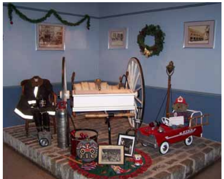
Newly painted space at the Biddeford Fire Department.

To many organizations around the southern Maine area this program is a shining example of giving back to the community while helping all entities stretch their dollar for maximum value. We in Correctional Trades enjoy helping our neighbors and try each day to set an example of work ethic that a crew member can use to turn their life in another direction and possibly learn a skill to carry with them for the rest of their lives. In closing we would like to say “Thanks” to those who have given this program the opportunity to prove its worth to the People of Maine.