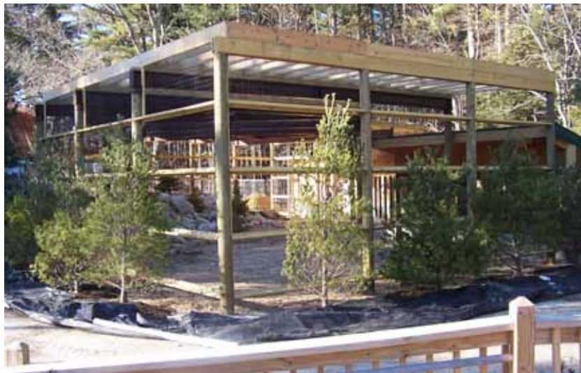
New mountain lion den at the Maine Wildlife Park in Gray.

One organization that has utilized the program to its fullest potential over the last twenty plus years is the Maine Wildlife Park located in Gray. With the hearts of the community and a Superintendent with a vision