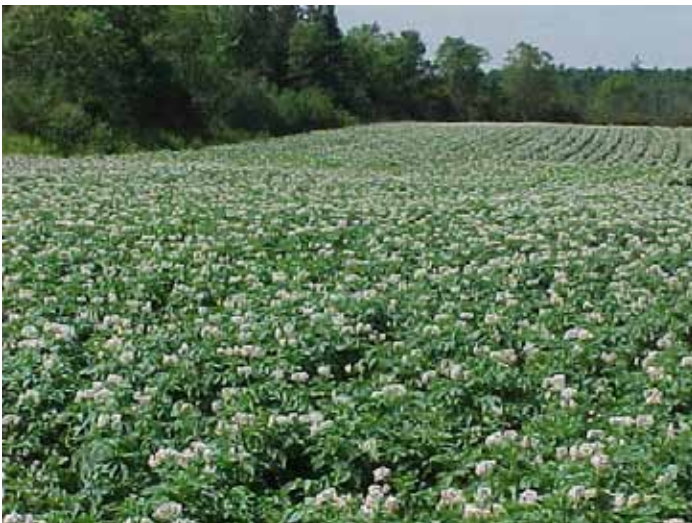
Potatoes growing in the field and stored in the cellar.