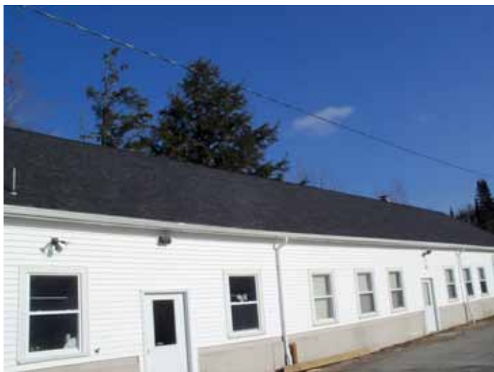
One of the many projects Charleston's work crews completed in 2011.