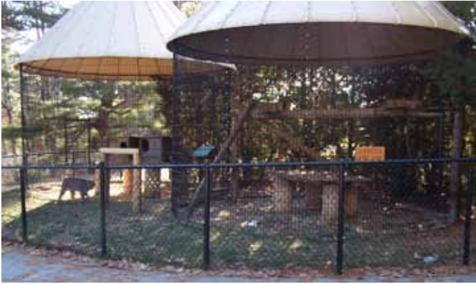
Temporary habitat for small cats at the Maine Wildlife Park in Gray.

of buildings. Now the Park is a shining example of what can happen when a community and a group such as ours come together. From top to bottom, one would be hard pressed to find anyone that did not call this a “win-win” situation; for the Park, the animals, the people of Maine and the hard working MCC crews.