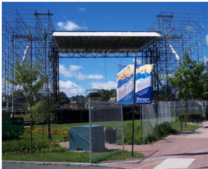
Bangor Folk Festival (above) and CCF work crews painting (below.)

During all this activity, our kitchen and storeroom crews have worked diligently to keep all crews stocked