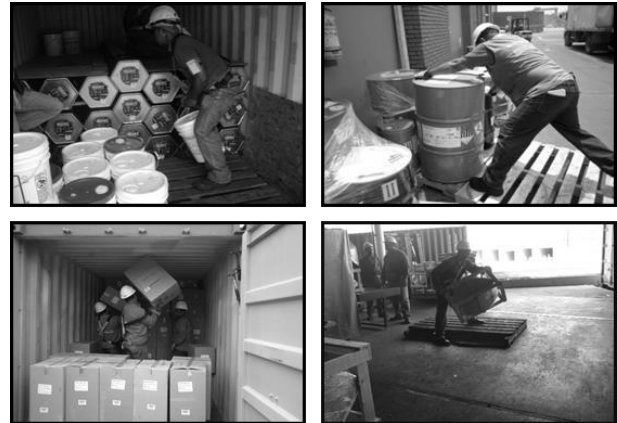
Figure 1. Tasks developed by stevedores

neither positive nor negative impact on the customers' perception. According to the results of RAM matrix, the researchers found that stevedores have the risk to suffer scoliosis level 2, low grade. For this reason, improvements should be made in the already established control systems. Regarding the induction plans, procedures and work instructions; a better operative steps sequence should be established to realize the activities in a safe way.