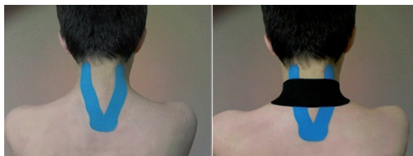
Figure 2. Application of neuromuscular taping with muscular inhibitory technique Y cut (blue taping), and space technique with I cut (black taping).

Definition of the interventions (independent variables): The physiotherapy treatment included damp heat and high frequency (100 Hz) modulated type TENS (Transcutaneous Electro Nervous Stimulation) simultaneously for 20 minutes, sedative massaging throughout the cervical region for 15 minutes, and TFNMP (Proprioceptive Neuromuscular Facilitative Techniques) specifically rhythmic stabilization on the cervical spine 13 . For the application of the neuromuscular tape, a Y-cut was made for the inhibitory muscular technique with a tension of 10% (paper tension) applied on the cervical muscular extender that presented muscular spasms, based at the first thoracic vertebra and anchored at either side of the upper end of the neck ( Figure 2 ).