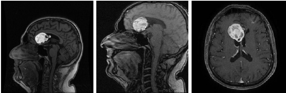
Figure 2: Magnetic resonance: Post-treatment residual hemorrhagic injury (2016).

The lesion was not studied by biopsy. He received concomitant chemo-radiotherapy (temozolamide 75 mg/m 2 continuous during WBRT to a total dose of 30 Gy). After concomitant treatment, he received eighteen cycles of temozolamide (200 mg/m 2 days 1-5 of 28 days). The clinical tolerance was acceptable, presenting only grade 2-3 emesis, which was controlled with standard antiemetic therapy.