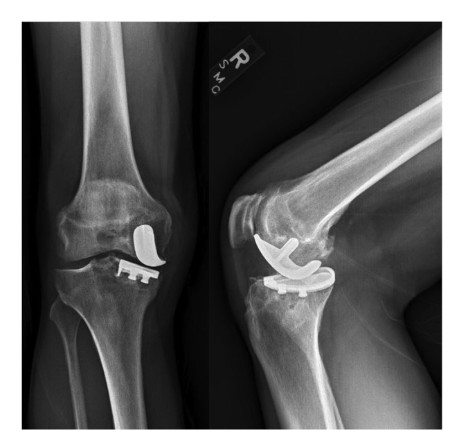
Figure 1. Anteroposterior and lateral radiograph of the right knee taken in 2010 (approximately 8 years after implantation) demonstrating unicompartmental knee arthroplasty with radiolucency around the tibial component and varus collapse, in addition to a radiolucent area around the femoral component suggesting loosening of the components.

skin rashes. The patient underwent knee joint aspiration, and the culture of the sample obtained was positive for Histoplasma capsulatum . Inflammatory markers were notably elevated: the erythrocyte sedimentation rate (ESR) was 106 mm/h (the normal value according to the Musculoskeletal Infection Society [MSIS] criteria is <30 mm/h), C-reactive protein (CRP) was 67.50 mg/L (MSIS normal is <10 mg/L), and the peripheral white blood cell count (WBC) was 14,000 cells/cm<sup>3</sup>. Furthermore, knee synovial fluid differential showed elevated total nucleated cell count of 1800 cells/uL, neutrophils at 31%, lymphocytes at 41%, and macrophages at 28%. The patient did not receive antibiotic or antifungal treatment before the laboratory workup.