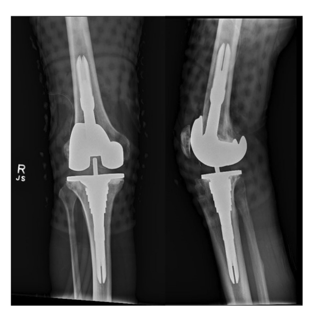
Figure 3. Total knee arthroplasty revision with diaphyseal engaging press fit stems and metaphyseal press fit sleeve on the tibia. Simplex P with tobramycin bone cement (Stryker, Mahwah, NJ) was used on the implant surface.

continued course of liposomal amphotericin B and prednisone. His antifungal suppression was continued with posaconazole for 3 years after total knee arthroplasty revision. At the most recent follow-up visit, 3.8 years after knee reimplantation, the patient had completed the antifungal treatment and continued immunosuppression with corticosteroids for his inflammatory response. His knee remained clinically asymptomatic. The patient denies having any fever and the range of motion of the right knee is 0-120 degrees of flexion and non-painful. There is no clinical evidence of systemic or local infection.