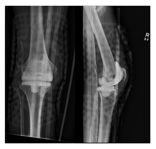
Figure 2. Anteroposterior and lateral radiographs of the right knee showing the second antifungal cement spacer (composed of 4 bags of cement mix containing 200 mg of amphotericin B and 1 g of vancomycin per bag of cement) placed after explantation of the initial spacer. Molds were used.

Five months later, the patient was readmitted to the hospital due to the presence of episcleritis, epididymitis, diffuse arthralgias, and skin rash. His prosthetic knee remained asymptomatic, whereas his inflammatory markers were found elevated (CRP [85.5 mg/L] and ESR [121 mm/h]). Serum histoplasmosis antigen testing remained negative, and the diagnosis of an autoimmune reaction secondary to the previous histoplasmosis was made. The exclusion of persistent disseminated histoplasmosis was made based on the serum and urine antigen testing. The patient responded to a