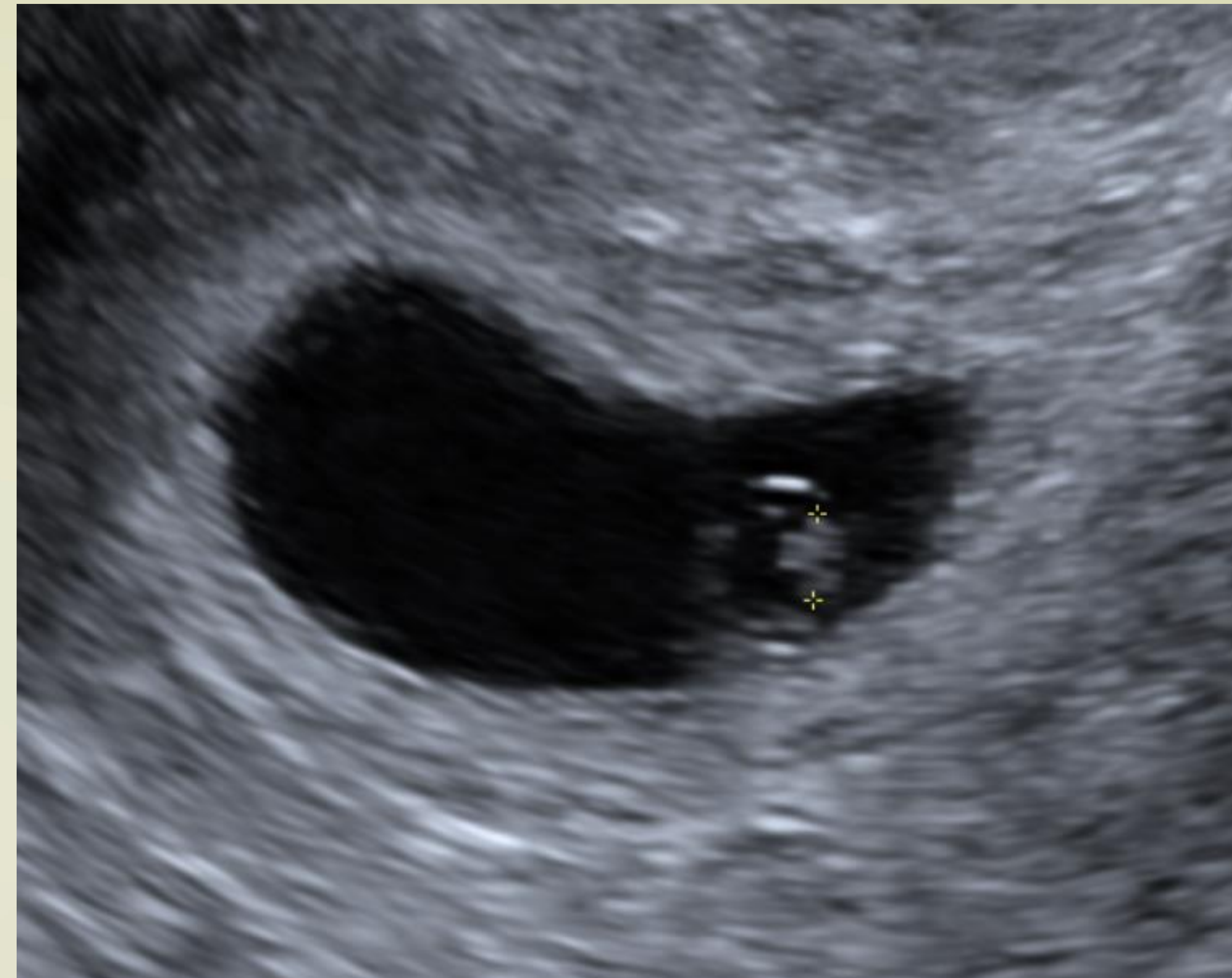
Fig 1. Uterus Trans