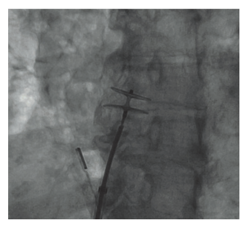
FIGURE 2: Fluoroscopic positioning and deployment of 18 mm Amplatzer Cribriform Septal Occluder.

ST-segment elevation in leads II, III, and aVF, followed by a significant decrease in the mean arterial pressure. Bedsides ultrasonography showed proper device position and no cardiac tamponade was noted. Intra-aortic balloon pump was inserted for hemodynamic support and vasopressors were started. A right coronary artery air embolism was suspected; therefore a coronary angiogram was performed and showed no abnormalities. Left ventricular angiogram and aortogram were within normal parameters.