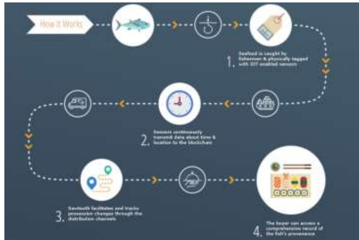
Figure 4: Intel's Marine Supply Chain Transaction