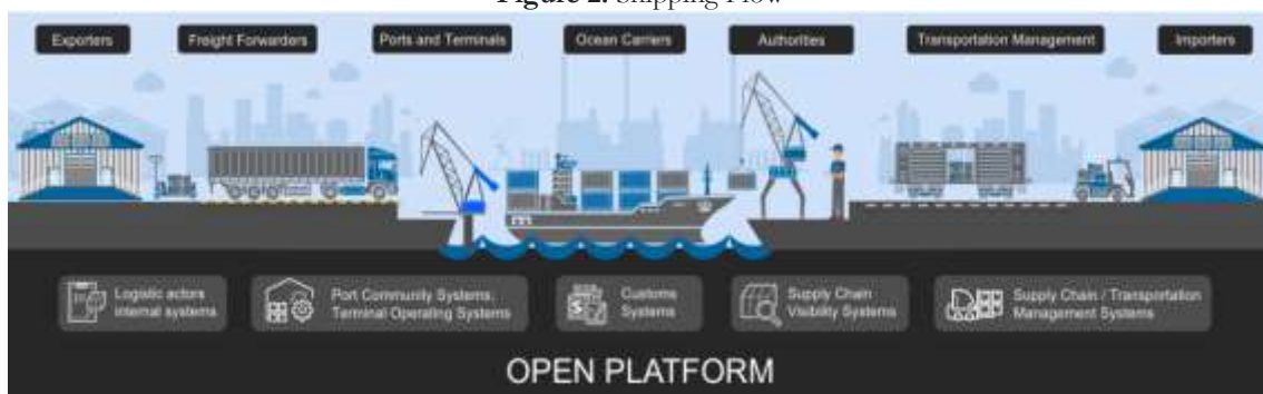
Figure 2: Shipping Flow

Then in February 2017, a pilot project started with Schneider Electric's empty containers in France Lyon. Then the factory was filled with empty container goods and sent to Rotterdam. In Rotterdam, the container was loaded onto a Maersk Line ship and moved to Newark Harbor in the USA. The number of agencies involved in the pilot is an idea of the complexity of international transport. Institutions include the Dutch Customs Administration, the US Department of Internal Security Science and Technology, and the US Customs and Border Protection. [10]