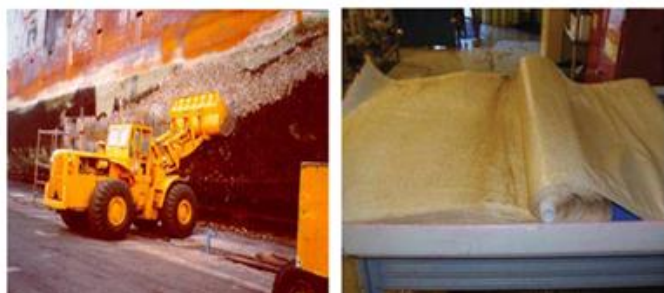
Fig. 2. Biofouling (a) management in ship yard (b) membrane sheets in industry

In many industries like water treatment, food processing, paper and milk industries biofouling have been found to be very serious problem regarding maintenance of different types of membranes (Anand et al. , 2014). It have been still a major challenge in terms of quality of water, plant performance and operating cost in different industries (Fig 2). Four major types of fouling occurs in membranes/filters viz;