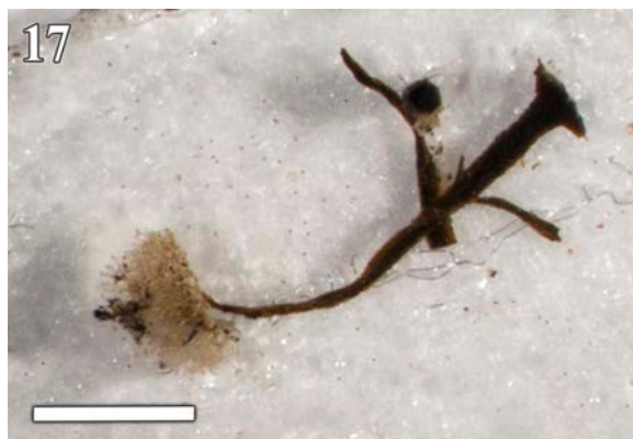
Fig. 17 Physarum flavicomum Berk., AH 45626. Sporocarp. Scale bar = 0.25 \mu\text{m}

Physarum leucopus Link is a similar species on the basis of color and stalk type, but differs from P. melleum macroscopically for its white sporotheca without columella.