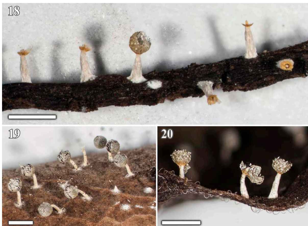
Figs. 18-20 Physarum melleum (Berk. & Broome) Masee, (18. AH 45628, 19. AH 45627, 20. AH 45629). Sporocarps, capillitium and columella. Scale bars = 1 mm

Argentina it has been reported from the provinces of Buenos Aires, Entre Ríos, Jujuy, Misiones and Tucumán according to de checklist of CRESPO & LUGO (2003). However, this species had already been commented before by MORENO & al. (2013a).