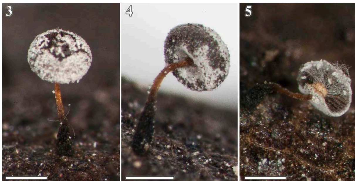
Figs. 3-5 Didymium megalosporum Berk. & M.A. Curtis, AH 45615. 3. Sporocarp. 4. Sporotheca discoid and umbilicate. 5. Discoid columella and branched and anastomosed capillitium. Scale bars: 3-5 = 0.5 mm

Material studied: Salta. Depto. Gral. José de San Martín, Reserva Provincial de Flora y Fauna Acambuco, S 22°