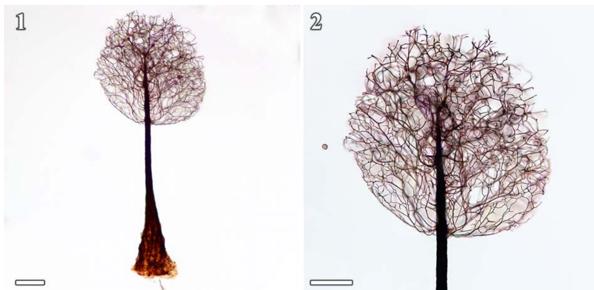
Figs. 1-2 Comatrixia ellae Härk., BAFC 22194. 1. Sporocarp. 2 Detail of sporotheca. Scale bars: 1-3 = 0.5 mm