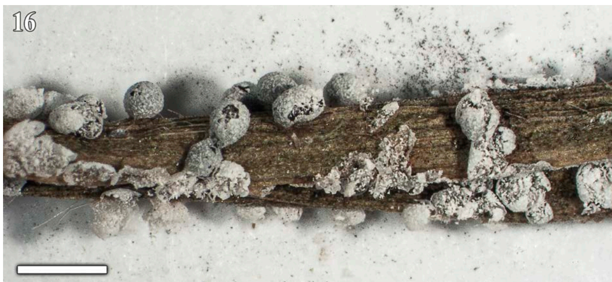
Fig. 16 Physarum cinereum (Batsch) Pers., AH 45621. Sporocarps. Scale bar = 1 mm

Sporocarps scattered, 0.8-1.2 mm in total height. Sporotheca globose cream-yellow to white with light yellowish (Figs. 16-18), 0.4-0.5 mm in diam. Peridium iridescent, membranous, thin and yellow or pale brown coloured. Dehiscence apical and irregular, with remains in the lower part of the sporotheca. Stalk whitish, broader at the base, longitudinally striate, 0.5 mm in height. Hypothallus eminent, circular and white. Capillitium strong, with large (up to 50 \mu\text{m} in diam), angular and yellowish white nodes connected by hyaline or yellowish filaments. Columella yellow to whitish (Figs. 18-20) and conical of 0.1 mm high. Spores globose, 7-8(-9) \mu\text{m} in diam, brown in mass, violet by transmitted light, minutely warted with groups of warts.