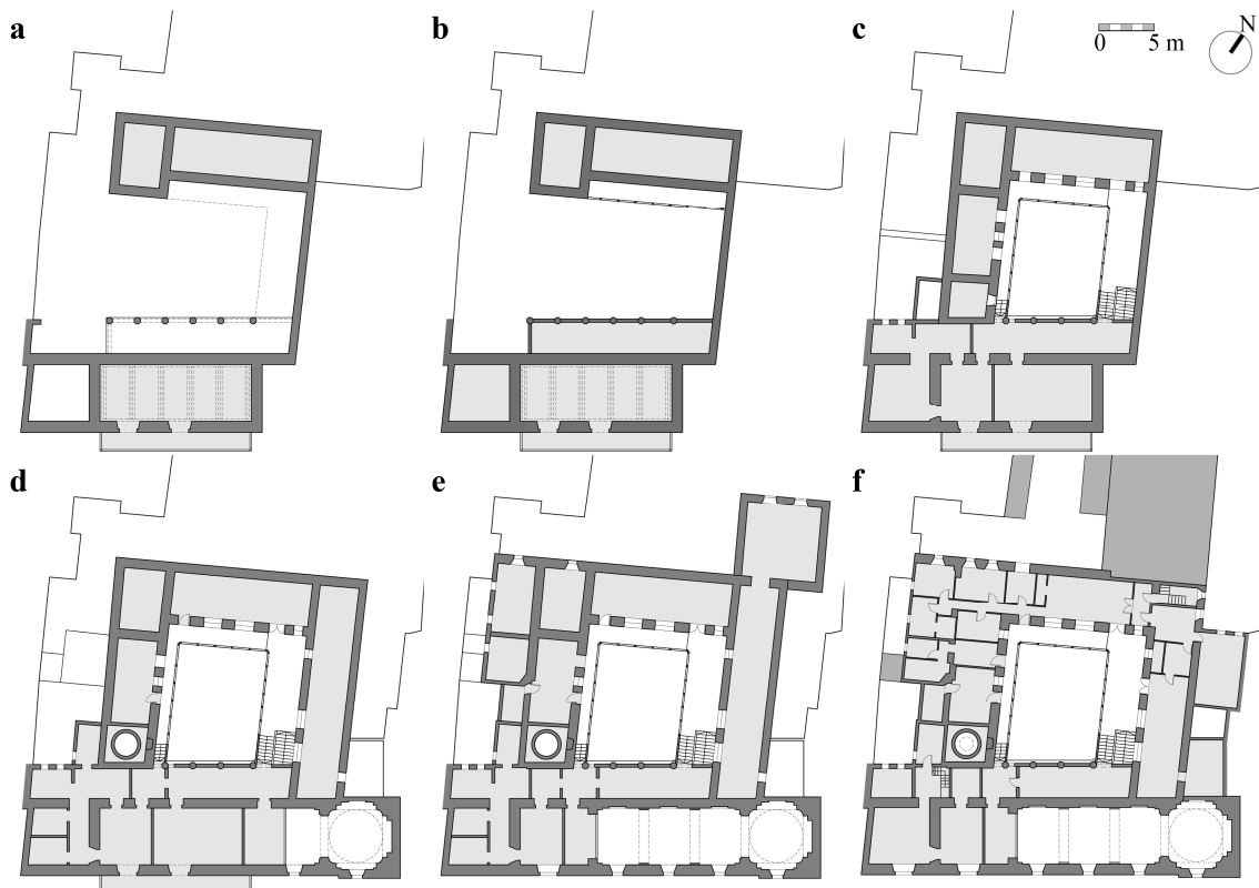
Figure 4. First floor plan. Hypothesis of the building transformation: a) 15 th century. b) 1483. c) 16 th century. d) 17 th century. e) 19 th century. f) Current state.