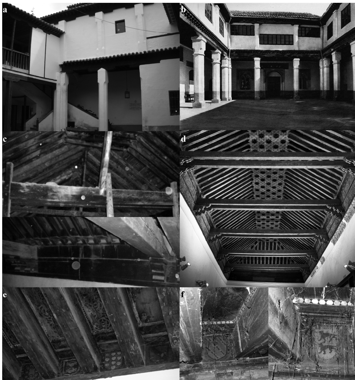
Figure 3. Comparative analysis between the Antezana Hospital (a, c, e) and the Palace of Fuensalida in Toledo (b, d, f): two-storey courtyard with galleries of octagonal masonry column (a, b); woodwork ceiling of the upper main hall (c, e) and decoration based on heraldic shields (e, f).

The results determined two groups of mortars very homogeneous. Group A samples were lime mortars (samples 1, 3, 4, 10, 12, 18 and 21) and group B were gypsum mortars (samples 1', 6, 11 and 16). In group A, feldspathic sand was used as aggregate. In group B, the main phase detected was gypsum. Gypsum samples contained some impurities, as small reflection of quartz and feldspar.