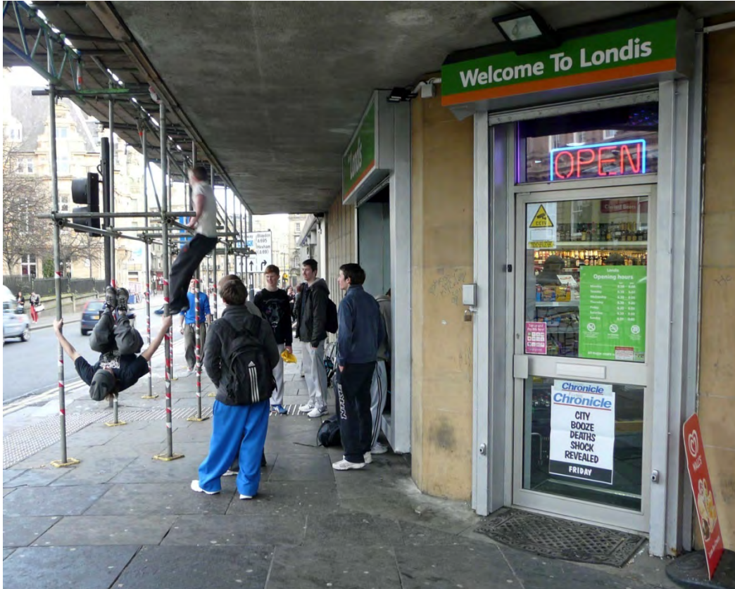
Figure 5. NEPK using scaffolding for gymnastics in the city centre on a Saturday, 2012. This may look like a nuisance but their active, sociaable days out are in stark contrast to the city's major problems shown by the local newspaper headline on the poster in the shop door "City booze deaths shock revealed".

My doctor advised me not to train anymore... but the idea of it... no free running... it makes me happy... it's like telling a fish to stop swimming. It's silly, it's a silly idea. (Jamie)