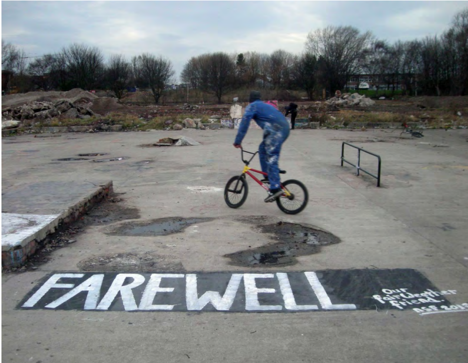
Figure 3. The Wasteland in 2012 days before being demolished by developers. The “Farewell our fair-weather friend” message was painted by local BMXers as a final salute to the site.

There is creativity to this use of space. Local skate parks are often regarded as boring, or perhaps okay as one part of a circuit of sites, but not as somewhere to stay all day. Freerunners don’t use formal skate parks at all. All these street-sports groups are therefore on the lookout for the potential in city spaces. Bryan noted,