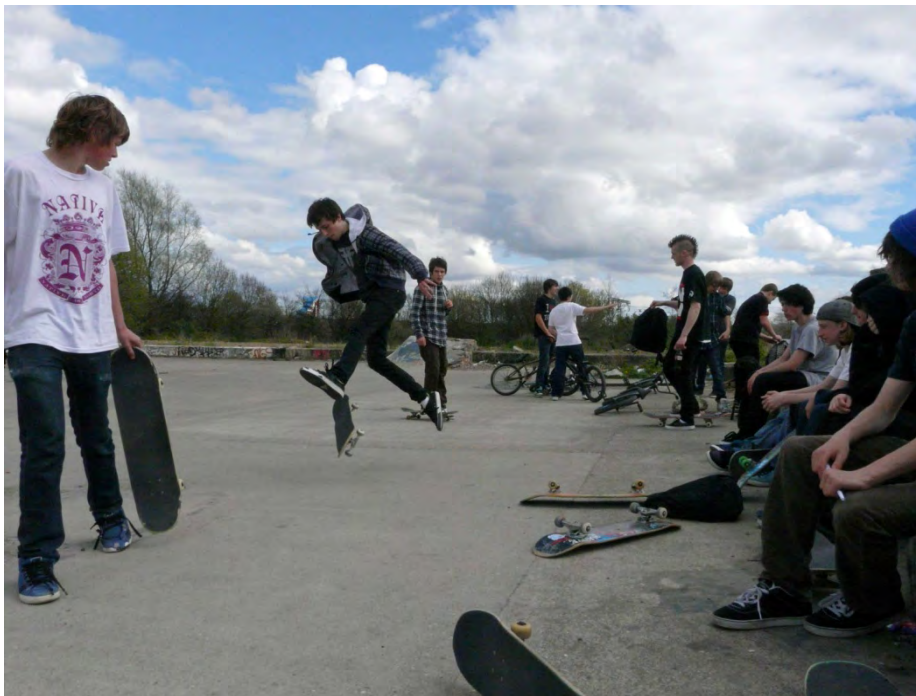
Figure 2. The Wasteland site in 2010, used by skaters, BMX and micro scooters. Note that most of the present are sitting chatting and watching rather than skating; the social side of the playing out is paramount.

Skaters have invested time, energy, and money improving some of the sites. The prime spot in Newcastle was the “Wasteland,” the old floor of a demolished factory. It was not an area frequented by the general public, but it was only a ten-minute stroll from the city center. For at least 15 years prior to 2012 when developers moved in, it was used by skaters and other youngsters as a place to hang out and to hold self-organized skateboard or BMX events. Over the years, skaters repeatedly built blocks and ramps there. The picture below (Figure 2) was taken on a typical day at the site; most of the skaters and BMXers were just hanging out chatting. The concrete floor is clean of debris because the skaters kept it clear. Given the chance, skaters, BMXers, freerunners, and other street-sports participants will not only create their own version of a city—they will also build and nurture space.