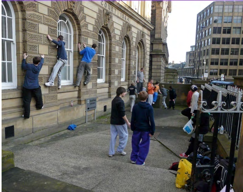
Figure 4. North East Parkour, Saturday morning at “Solicitors”, 2012. This favourite spot is the front of a local law firm, but the offices are not open on Saturday. The site is on a main road so the free runners are conspicuous

side of the photo, “CITY BOOZE DEATHS SHOCK REVEALED.” It points to a dark side of the economy of youth party culture. Like many British cities, Newcastle suffers from binge drinking, alcohol abuse, and attendant violence. In contrast, NEPK members are conspicuously healthy. As far as we know, none of them smoke. They bring wholesome food to their events. Many of the participants are trained gymnasts, and several are developing businesses as personal trainers or parkour instructors. Parkour has been characterised as a positive mix of martial arts discipline and “playful, childlike curiosity” (Ameel & Tani, 2012), and its outdoor group sessions are a powerful form of collaborative learning (O’Grady, 2012). It is hard to imagine a group more different from the stereotype of unhealthy, sedentary, antisocial youth. All that parkour participants need is the city to play in.