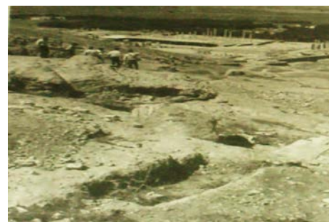
Figure 4 : Change of Land Use in the ziggurat