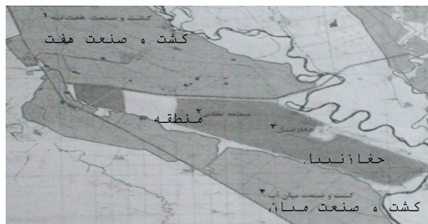
Figure 3 : Persepolis , drilling in the collection’s frontag