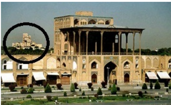
Figure 1: Naghsh e Jahan Square in Isfahan (Jahannama Tower)

Naghsh e Jahan Square in Isfahan ( case of Jahannama Tower): Construction a 12 -story tower at 700 meters from Naghsh e Jahan Square and on the periphery of Chahar Bagh Abbasi Street (in 2001) registered in the national index (Figure 1), has made one of the most controversial issue of cultural heritage in the country. While the UNESCO World Organization, the President of that time, Interior Minister, former Minister of Culture and Cultural Heritage Organization, International World Heritage Committee, the media, cultural heritage activists, Governor of Isfahan, and former Chairman of the Administrative Justice Court explicitly called to stop the construction Jahannama Tower and cut in its height ( Azimi, 2011). In such circumstances, after the short period of UNESCO's deadline to put Naghsh e Jahan Square in the list of endangered places of the world, the court voted to moderate the tower and ordered to lessen some floors of this tower and again its historic frontage was switched back to the first place. However, the internal construction of the tower continued and lasted up to UNESCO's deadline and finally it was stopped after the serious threat of UNESCO and Naghsh e Jahan Square was saved from a serious risk.