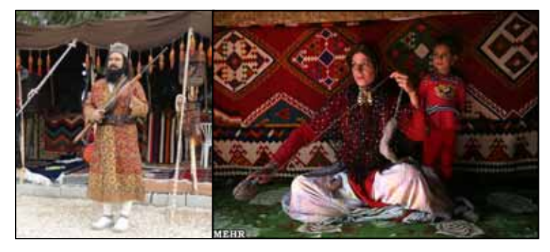
Figure4. The garment of men and women of Qashqai Tribe

Qashqai's women's clothing, according to the pastoral life and permanent migration and considering safety issues and veil, includes kerchief which is a delicate and thin fabric that is sewed in specific form and used as scarf, Yaghlugh (kerchief), King is a long shirt and up to just below the knee and Arkhalogh (female) is worn as warm clothing but that's why it is a beautiful and preserving garment and is the reason of dignity of the clothing, and is used in most seasons. Figure 4 shows the cover of Qashqai's men and women.