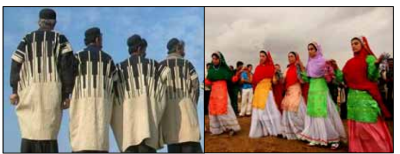
Figure 3. The garment of men and women of Bakhtiari Tribe

The lines resemble that in the dark, white columns have emerged and although some of them are broken and interrupted but at the end, elevated the black and have seen the light. A typical Bakhtiari woman garment respectively are, Lachak, Meyna, long shirt, Gheri pants and Giveh. The age of people saliently affects the color they select. Domestic materials are used entirely to sew this type of garment. Figure 3 shows the garment of men and women of Bakhtiari Tribe.