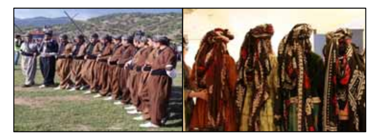
Figure 5. The Kurdish garment of men and women in Central Plateau of Iran

Kurd women's clothing is Jafy a kind of pants similar to men, Kalanjeh a jacket which worn on the long shirt, Scarf or hat made of cardboard and Kalkeh is a scarf or turban used by women instead of hat. Figure 5 shows the Kurdish garment of men and women in Central Plateau of Iran.