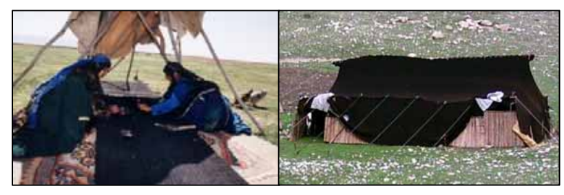
Figure7. Nomadic Black-Tent

Palās weaving: A fabric which its warp and woof are the fibers of goat hair. Palās as long and short width rectangular components is weaved by nomad women. Then the pieces are sewed from the edges and acquire large pieces which are the same portable nomadic roof (Black-Tent) which is raised by rope, wood, wooden or metal tip and large nails. Figure 7, shows an example of a nomadic Black-Tent.