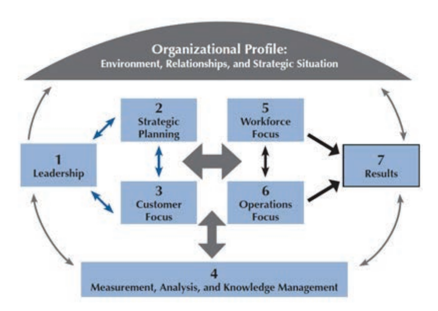
Figure 1. Criteria for Performance Excellence (2012)