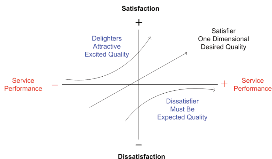
Figure 2: Kano model

This model has been developed and introduced by Professor Kano in last of 1970's. The model developed a classification for customers' requirements which can be used for measuring customers' satisfaction of services quality. Kano et al. (1984) introduced two-way quality model that is based on the customers' expectations and perceptions. The horizontal axis of the model refers to the extent of quality and vertical one refers to customers' satisfaction of services quality (kua, 2004). The model has been showed in figure 2.