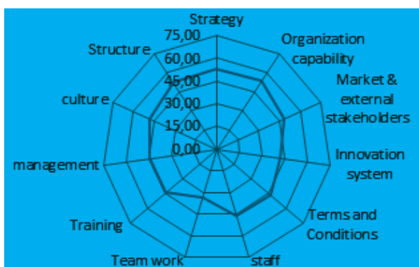
Figure 2: Existing gap in comparison to the optimal level of innovation capabilities.