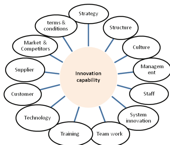
Figure 1: conceptual model

This conceptual model was derived from a literature review of existing models and has been used to design indicators and questionnaires, it shown in Figure 1.