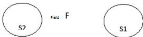
Figure 2. Substance-field model

In case of using this model, if instead of complete system as figure 2 models (two substances and at least one field), we faced an incomplete system or complete but harmful effect, the system is completed by adding some items. One of the features of the model is such that after modeling the problem, 76 standard solutions are used to achieve the improvement and innovation.