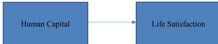
Fig 3: Effect of Human Capital on Life Satisfaction

X 1 = Independent Variable (Human Capital)