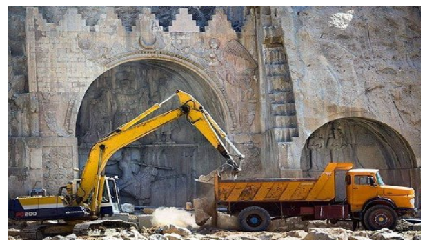
Figure 2: Tagh e Bostan, Kermanshah,