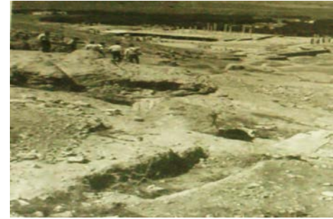
Figure 4 : Change of Land Use in the ziggurat