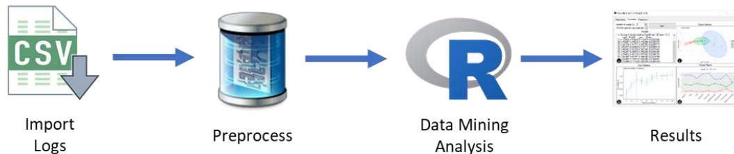
FIGURE 1. Data mining process

The developed tool operates in accordance with the process shown in Figure 1. It uses the logs exported from the Moodle learning management system as input and carries out data mining analyses on these logs. It generates visual and textual reports of the obtained results for the user. The details regarding each component of the process are given below.